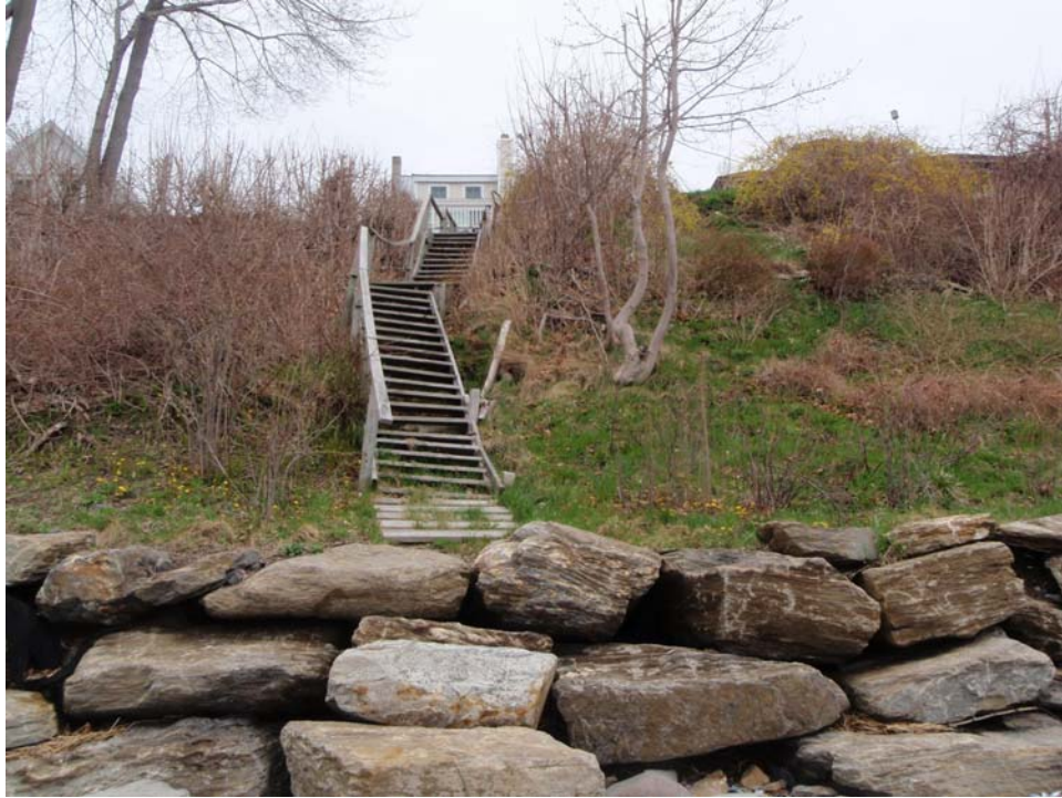
View of Existing Stair from Beach. New stair follows existing alignment