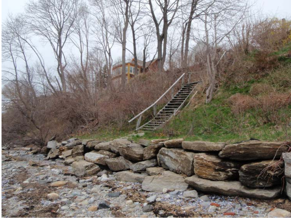
Oblique View of Stair from Beach