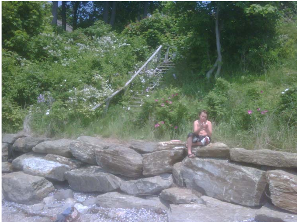
Summertime View showing vegetated slope