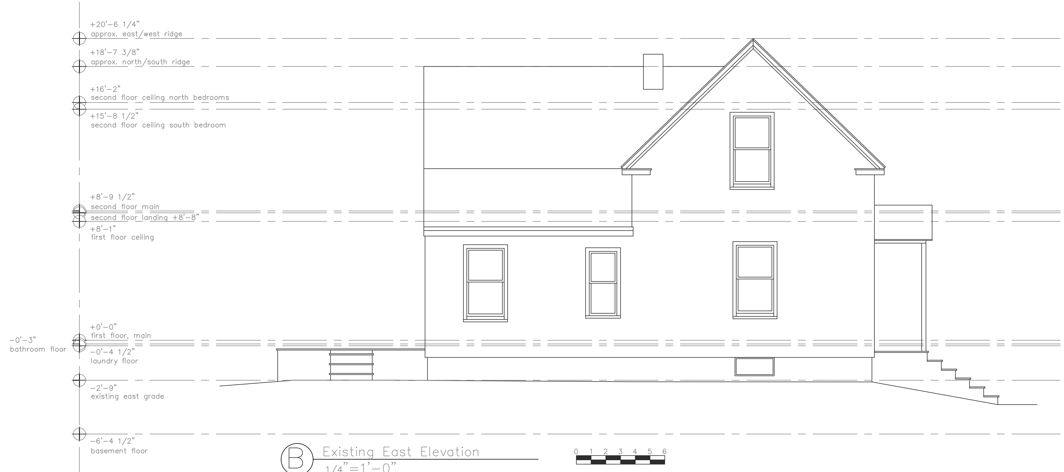
(B) Existing East Elevation 1/4" = 1'-0"