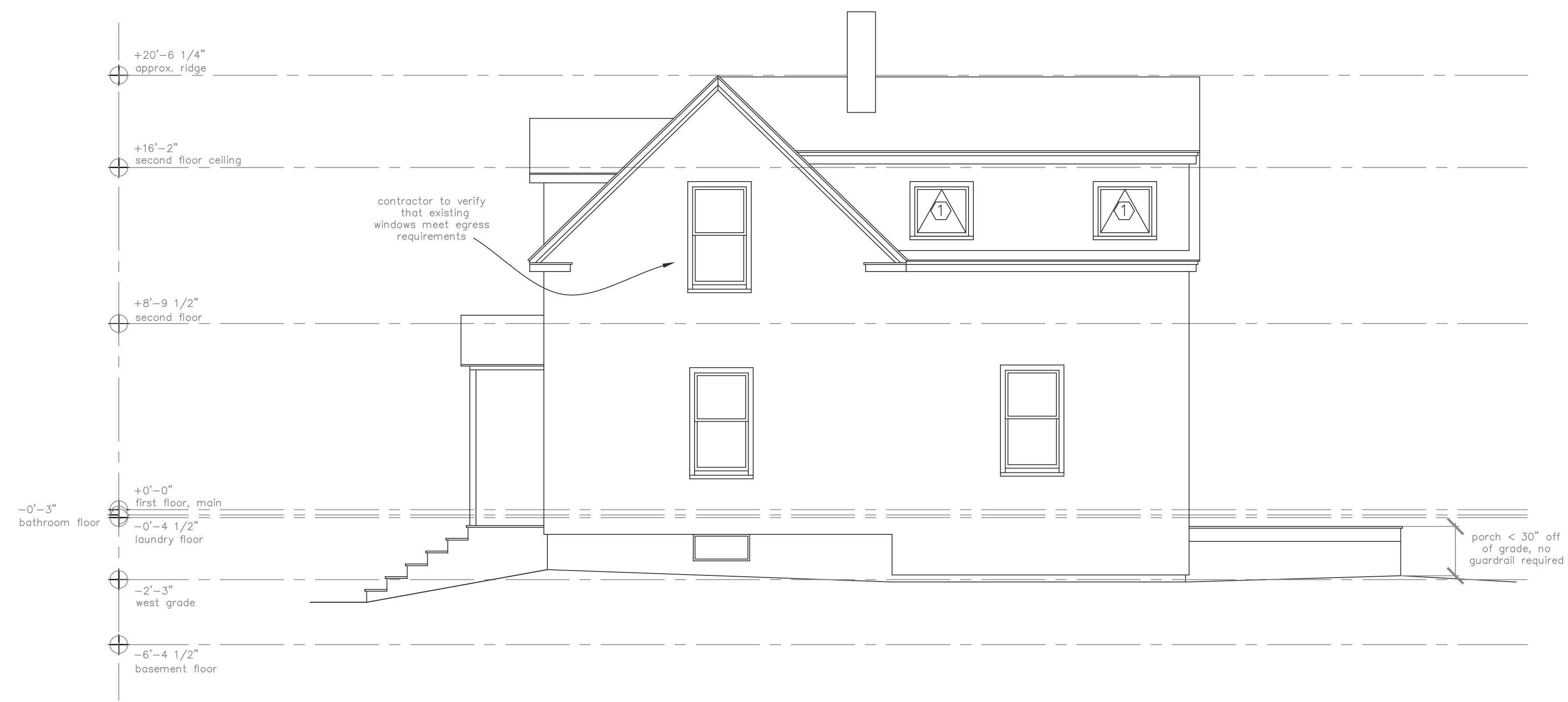
A Proposed West Elevation 1/4" = 1'-0"