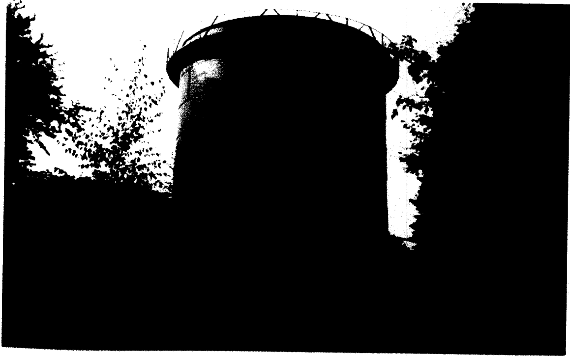
"A" Street Side Looking Southerly