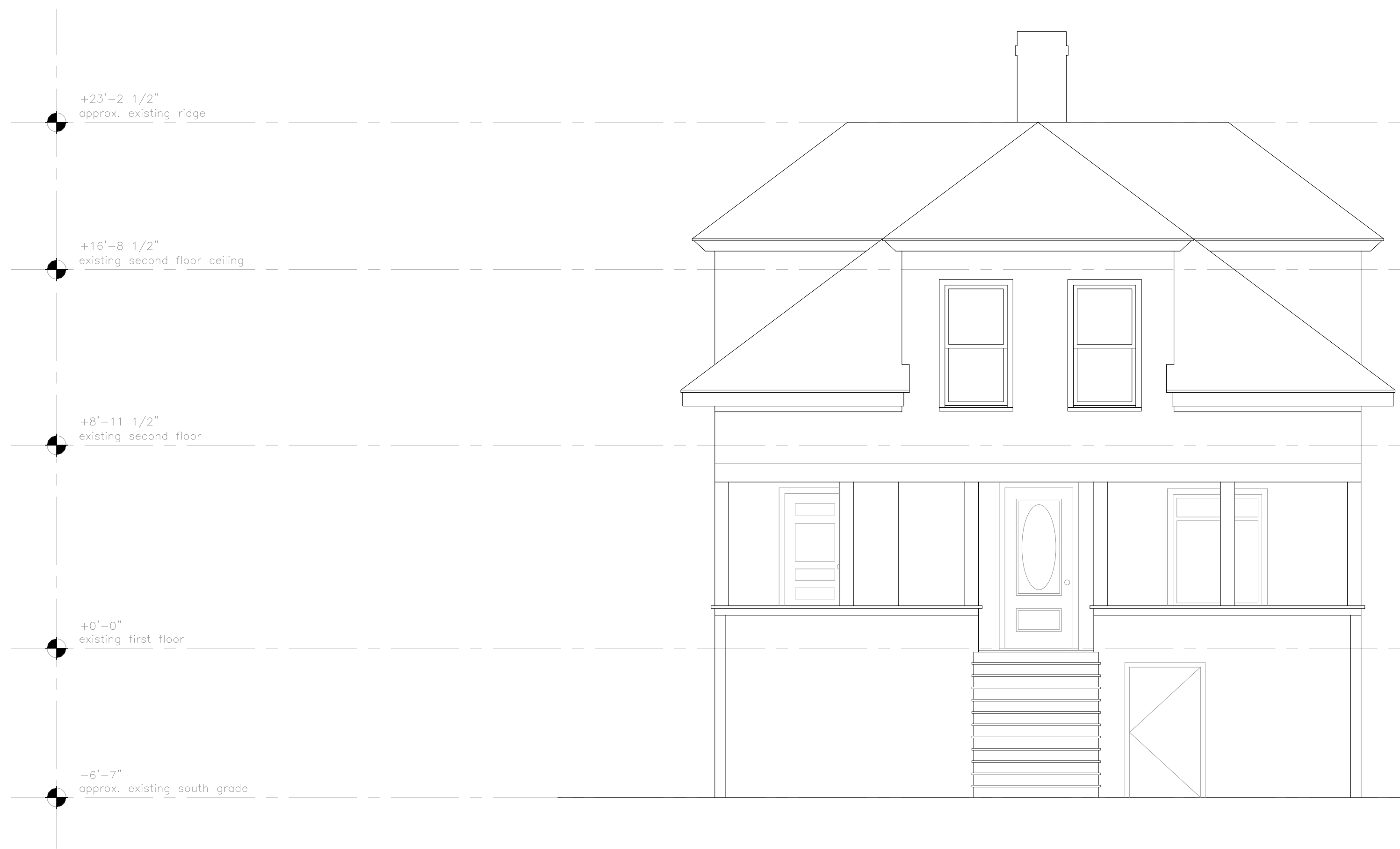
A Existing South Elevation 1/4" = 1'-0"