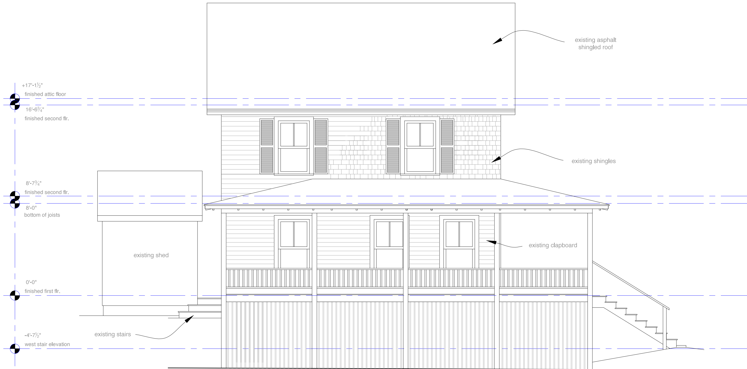
A Existing North Elevation