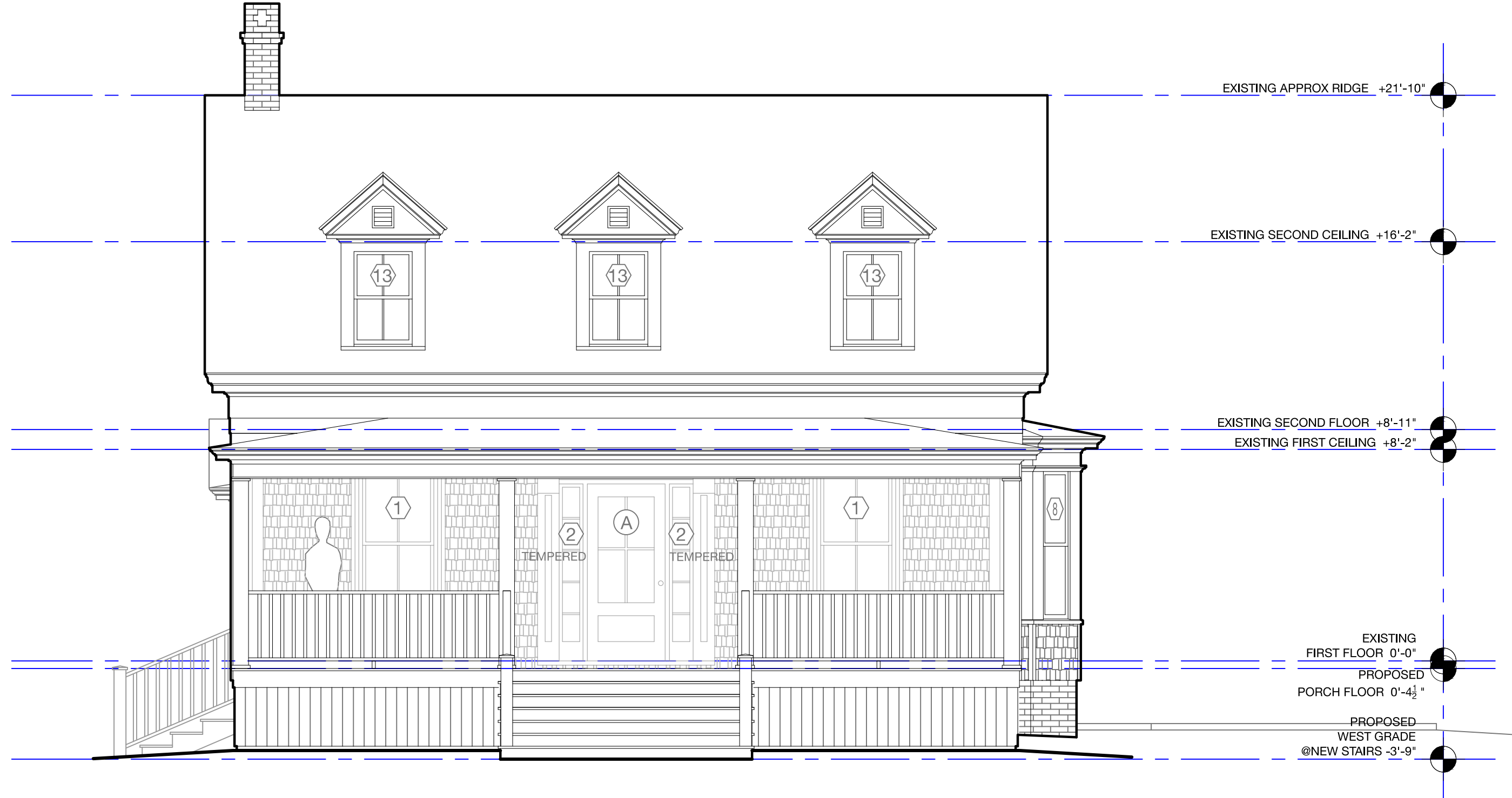
A Proposed West Elevation: