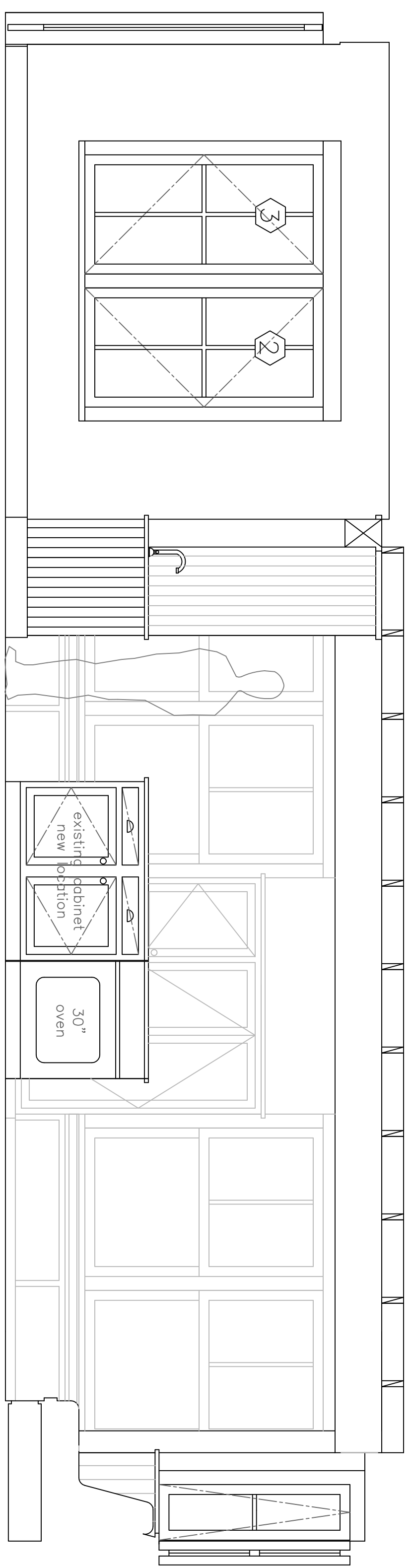
C Proposed Dining Room/Kitchen: South 1/2" = 1'-0"