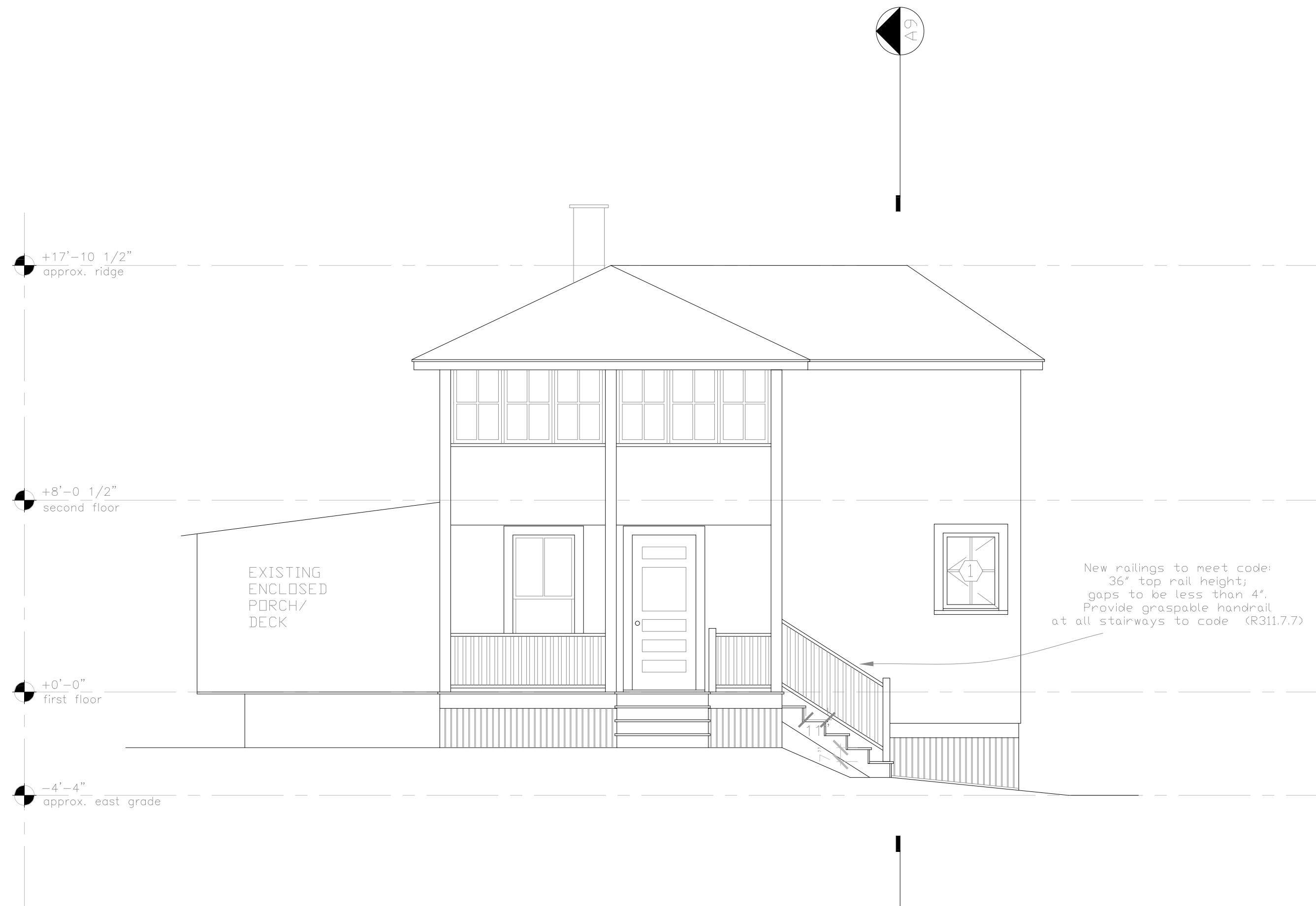
A Proposed South Elevation 1/4" = 1'-0"