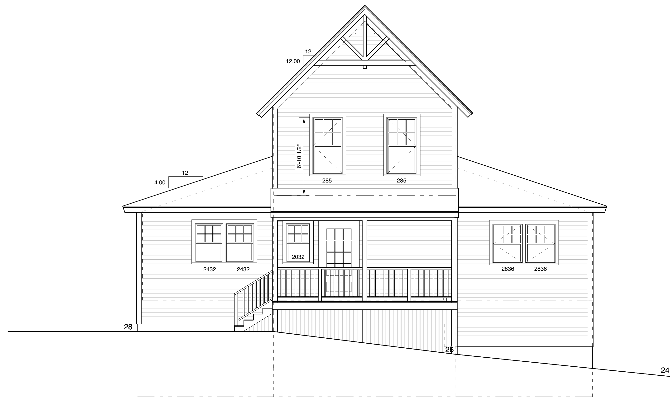
2 WEST ELEVATION A201 SCALE: 1/4" = 1' - 0"