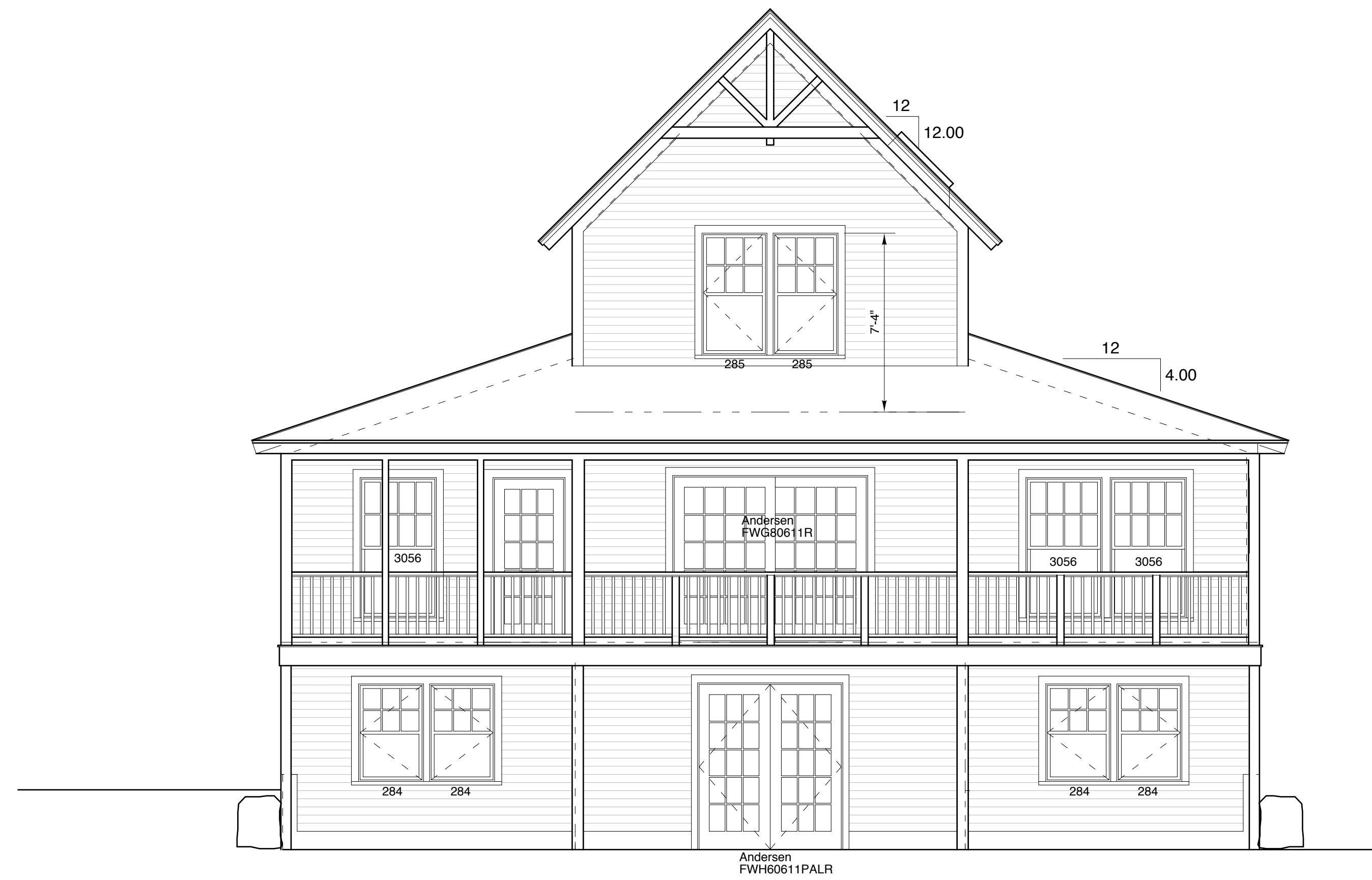
2 EAST ELEVATION A200 SCALE: 1/4" = 1' - 0"