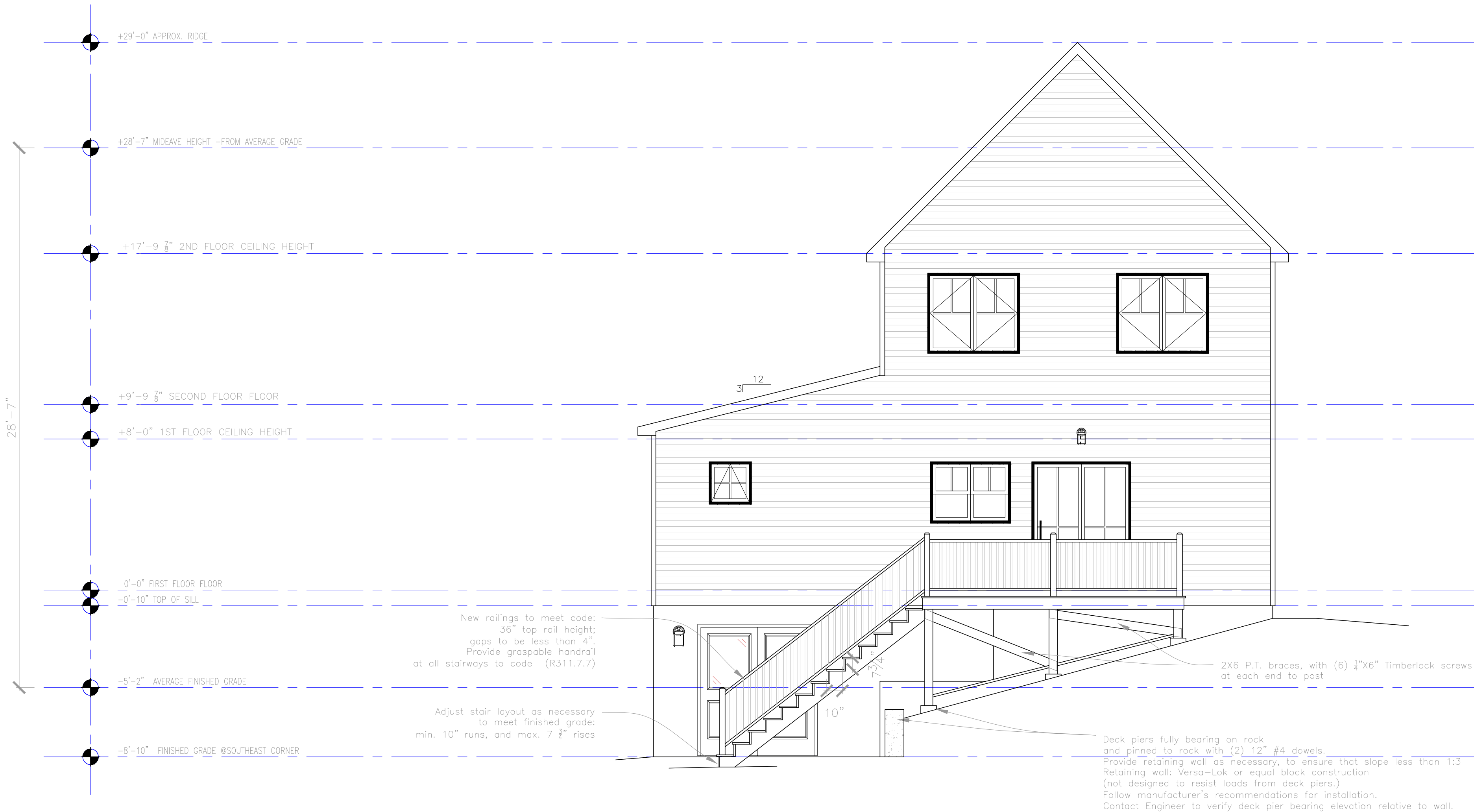
A Proposed East Porch/Deck Elevation 1/4" = 1'-0"