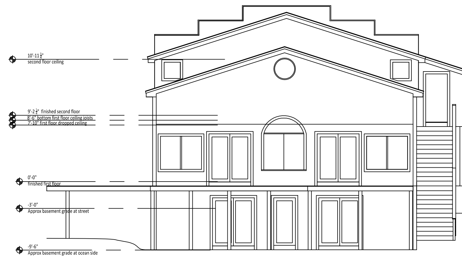
1 EXISTING WEST ELEVATION 1/8"=1'-0"