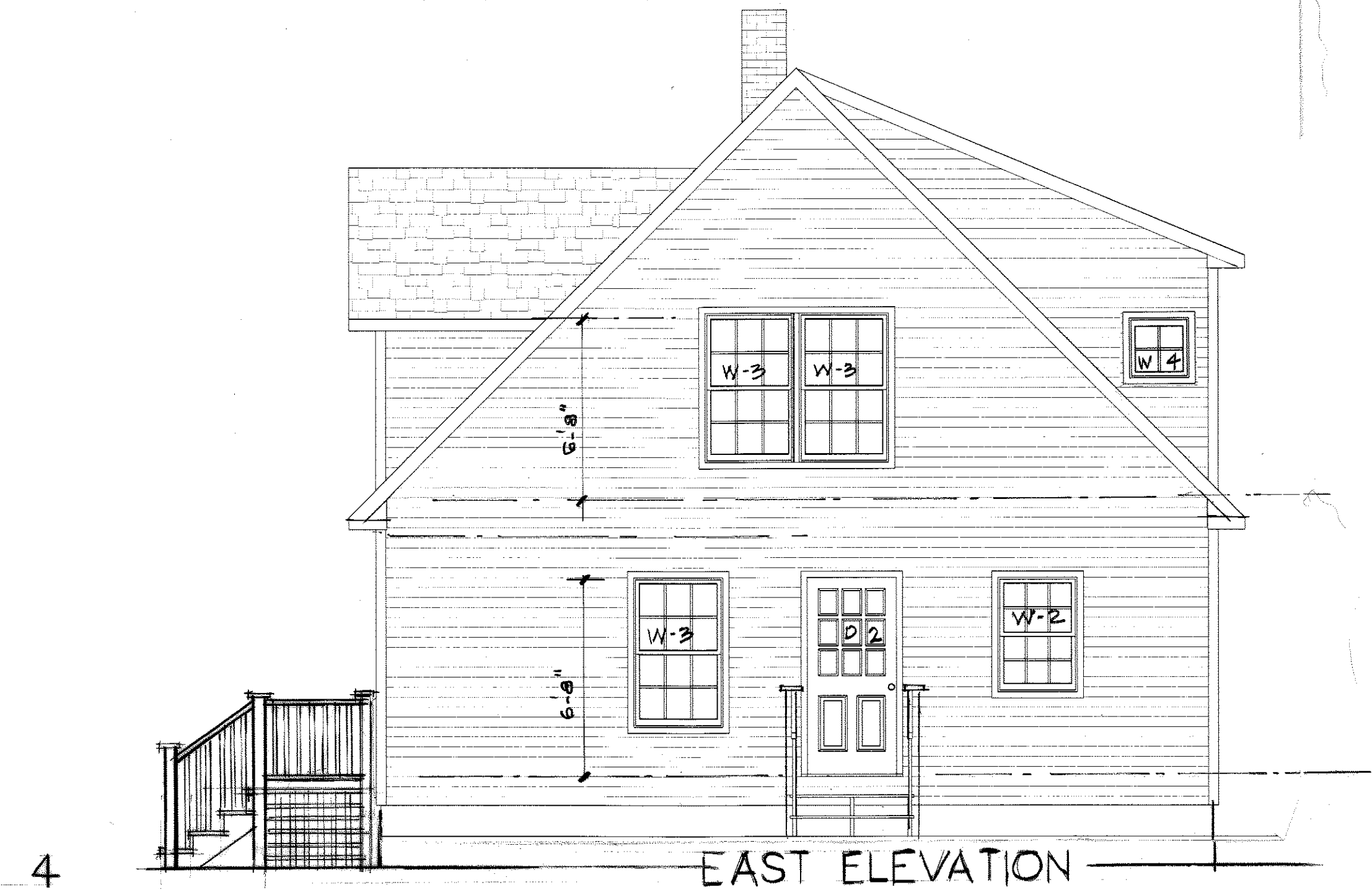
4 EAST ELEVATION scale : 1/4" = 1'-0"