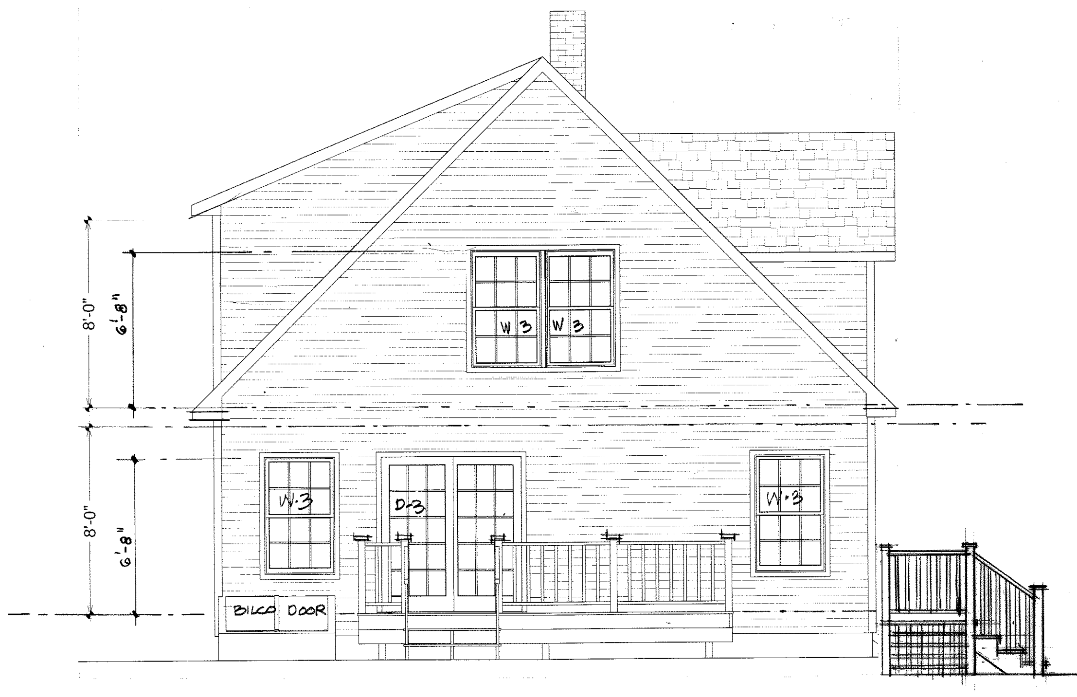
2 WEST ELEVATION scale : 1/4" = 1'-0"