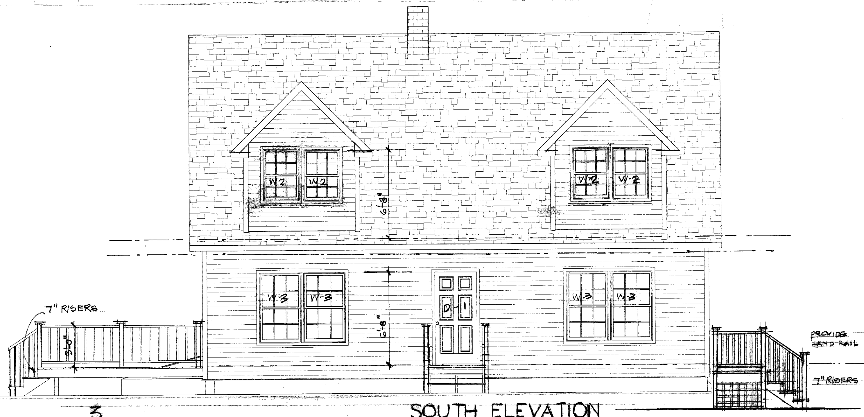
3 SOUTH ELEVATION scale : 1/4" = 1'-0"