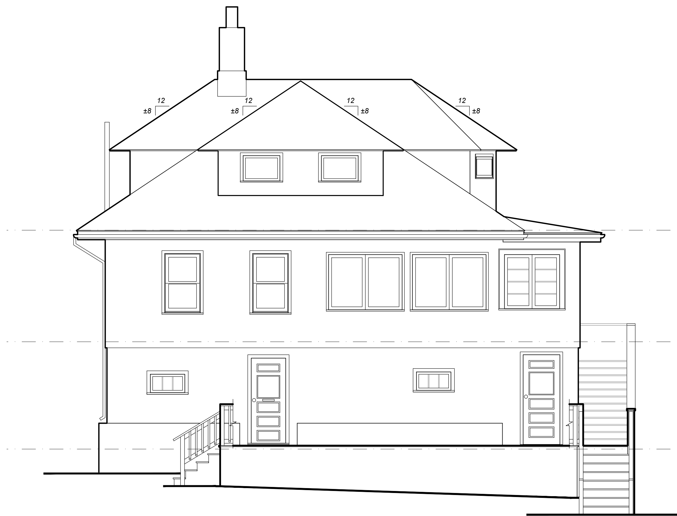
4 EXISTING WEST ELEVATION Scale: 1/4" = 1'-0"