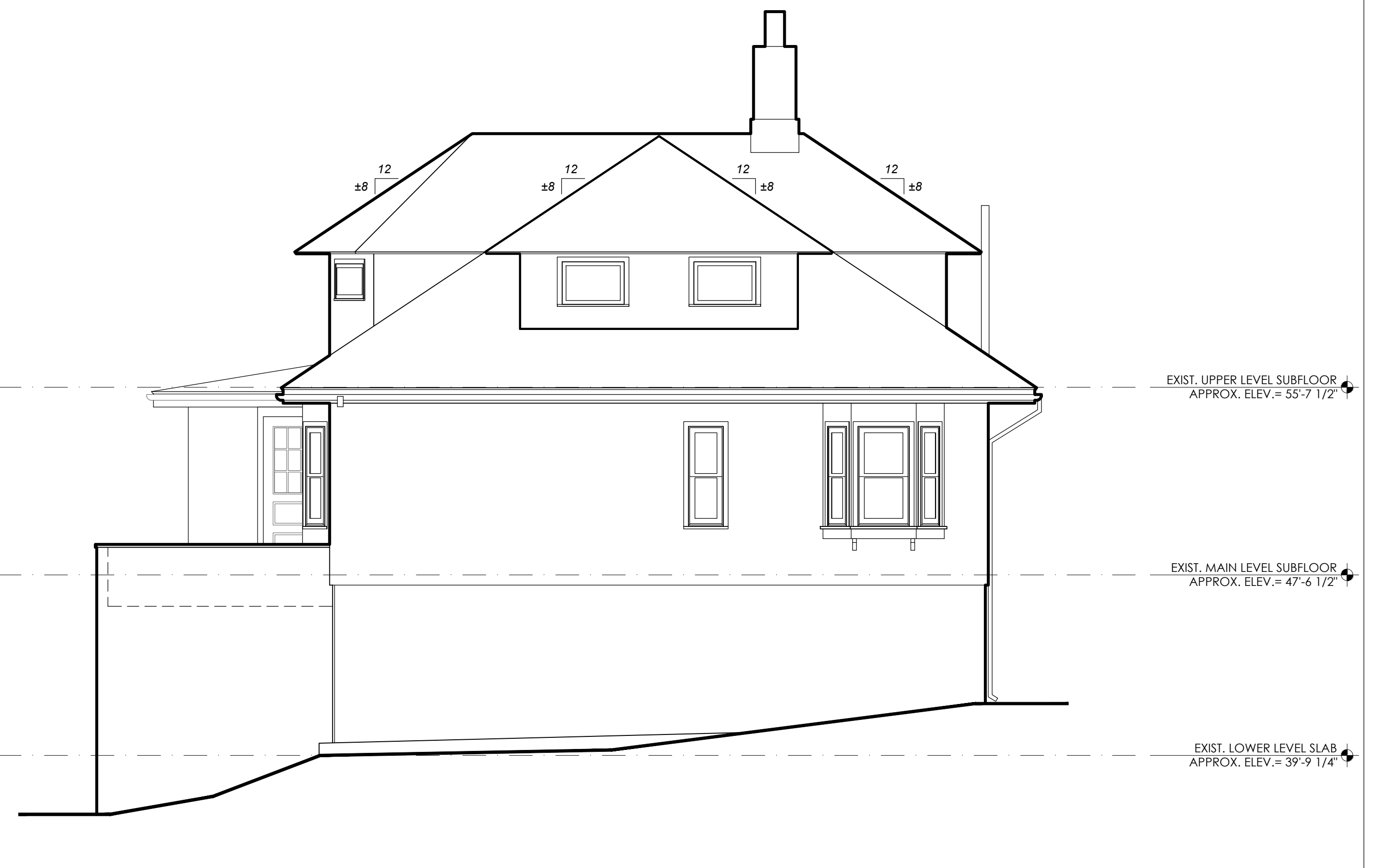
3 EXISTING EAST ELEVATION Scale: 1/4" = 1'-0"