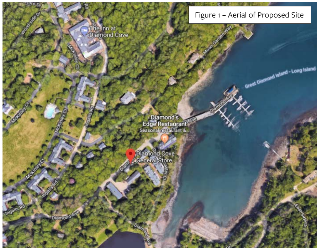
Figure 1 – Aerial of Proposed Site

A total of seventy-nine (79) notices were sent to property owners within 500 feet of the site and interested party list. A legal ad ran on February 19 th and 20 st , 2018 of the Portland Press Herald. Public comments received by the Planning Office are compiled and included as Public Comment in the packet.