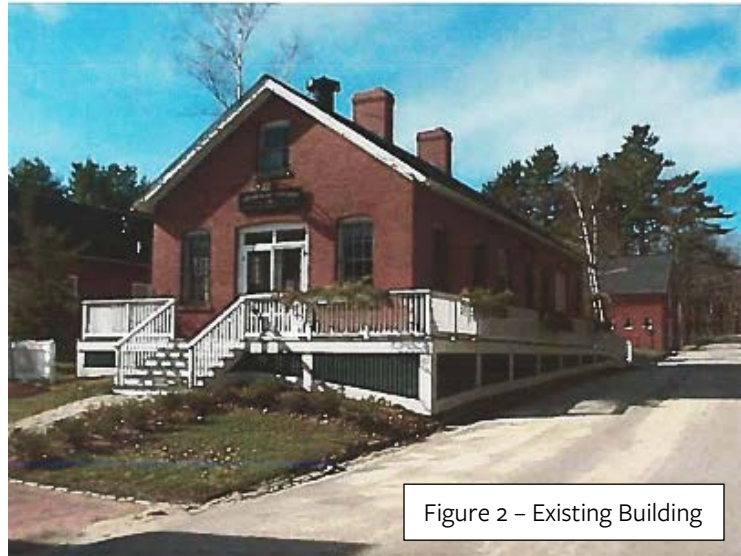
Figure 2 – Existing Building

Retail establishment: Means (1) any food service establishment as defined by section 11-16 of this Code, with indoor seating capacity for nine (9) or fewer patrons; or (2) any shop or store offering goods or merchandise to the general public for direct consumption and not for resale, but does not include temporary freestanding stands in either case; however, retail establishments combined with gasoline, diesel or propane fuel sales shall be considered a single use for zoning purposes and shall constitute a major or minor auto service station.