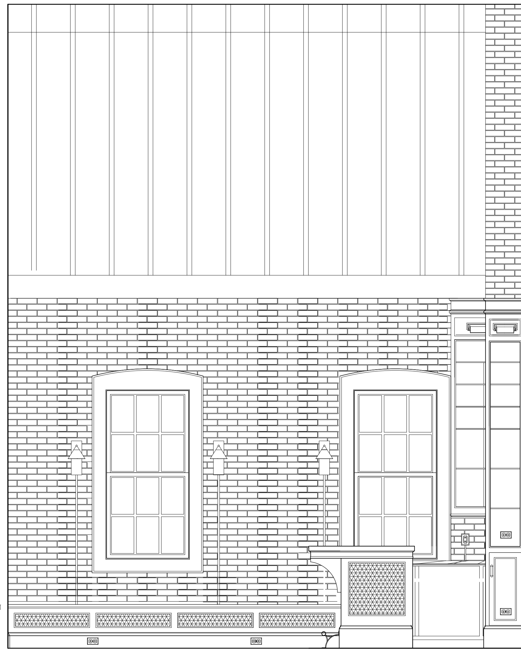
2 MAIN DINING ROOM: WEST ELEVATION 1-1.1 Scale: 1/2"=1'-0"