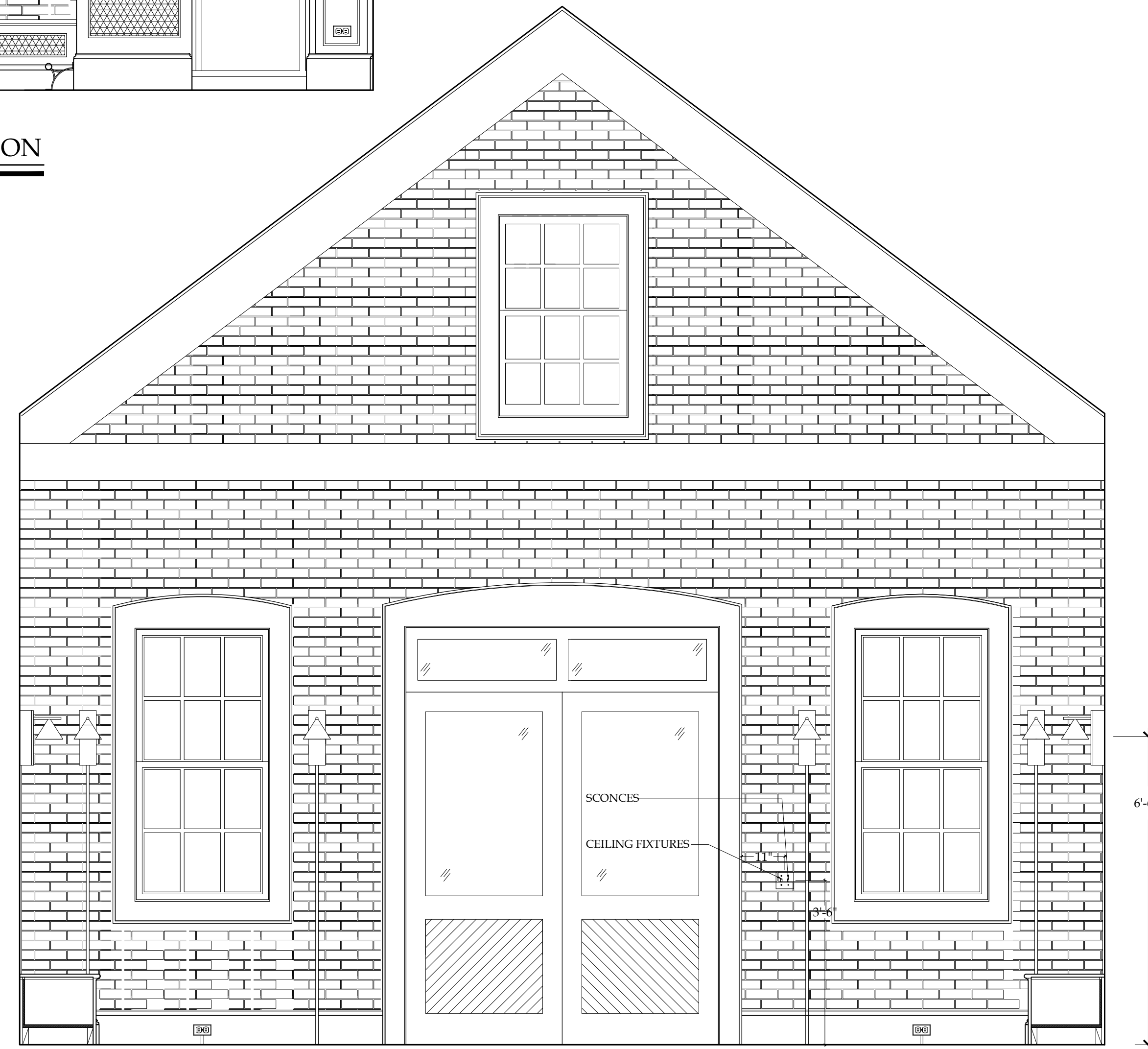
4 MAIN DINING ROOM: SOUTH ELEVATION 1-1.1 Scale: 1/2"=1'-0"

WINDOW CASING TO FOLLOW CURVE OF THE WINDOW SURROUND (NO TABS- TABS CAN BE PAINTED TO MATCH WALL)