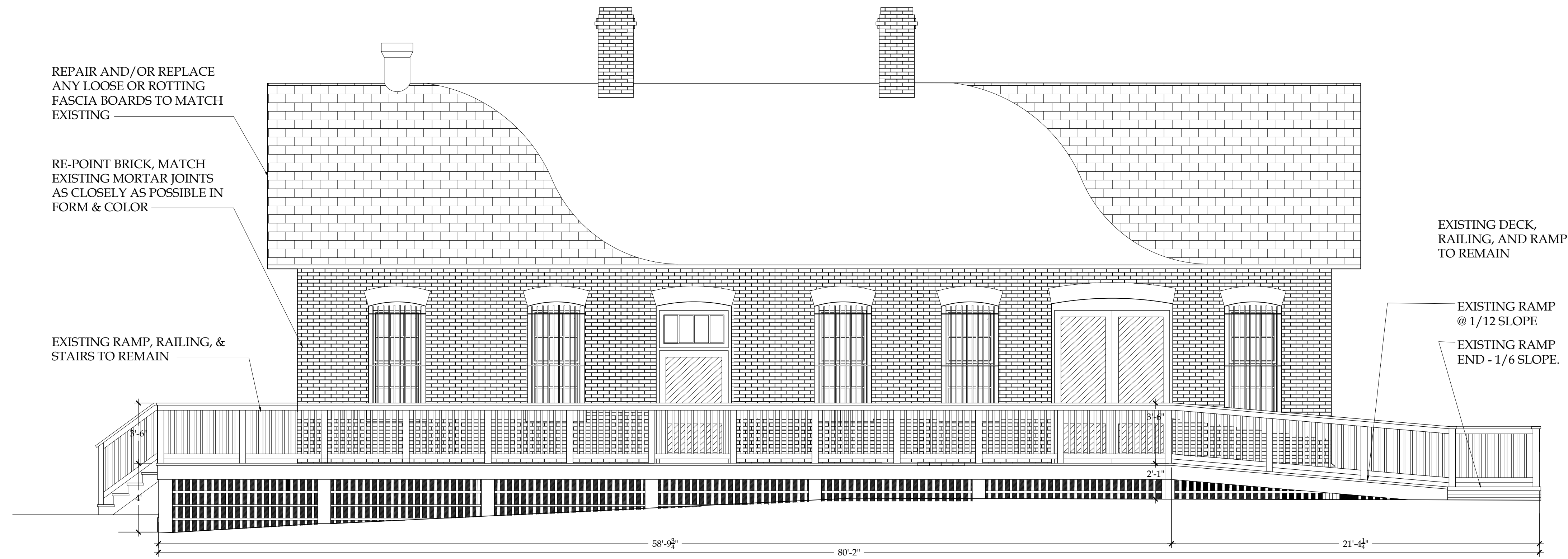
1 EXISTING WEST ELEVATION A2.1 Scale: 1/4"=1'-0"