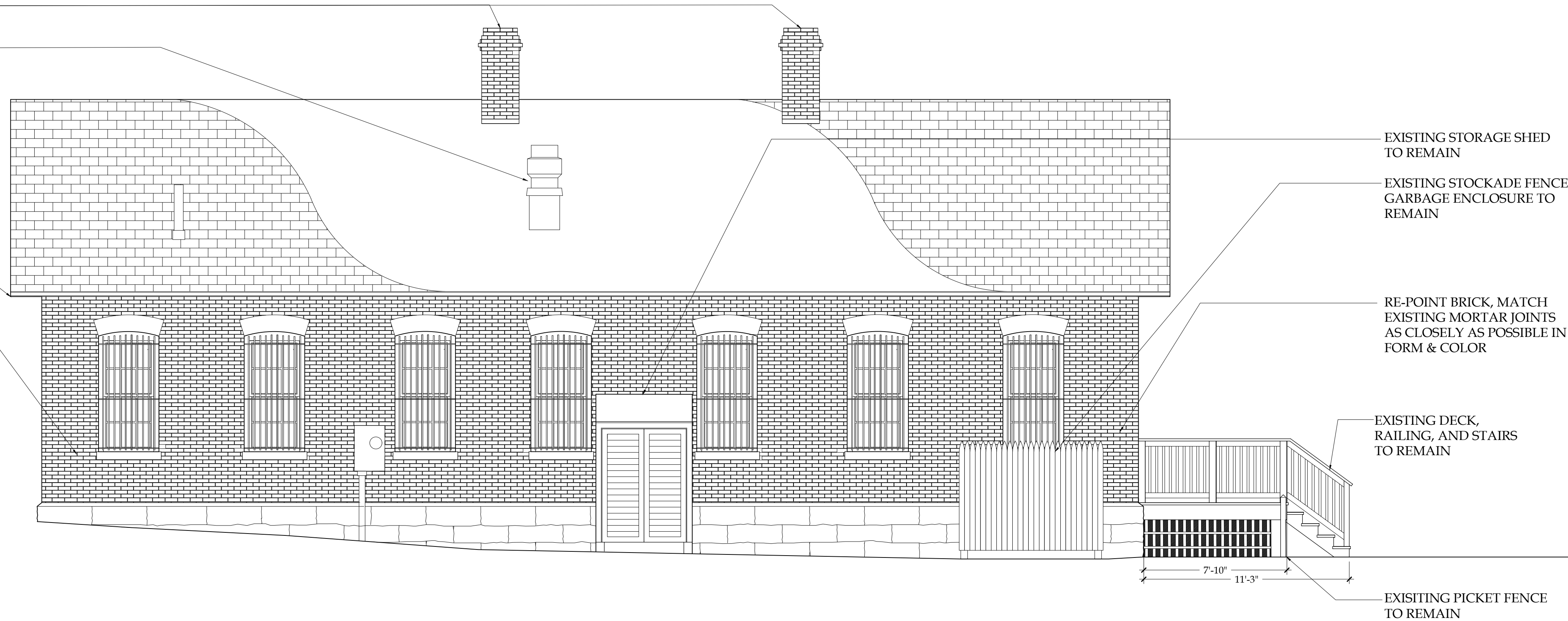
2 EAST ELEVATION Scale: 1/4"=1'-0"

RE-POINT BRICK, MATCH EXISTING MORTAR JOINTS AS CLOSELY AS POSSIBLE IN FORM & COLOR