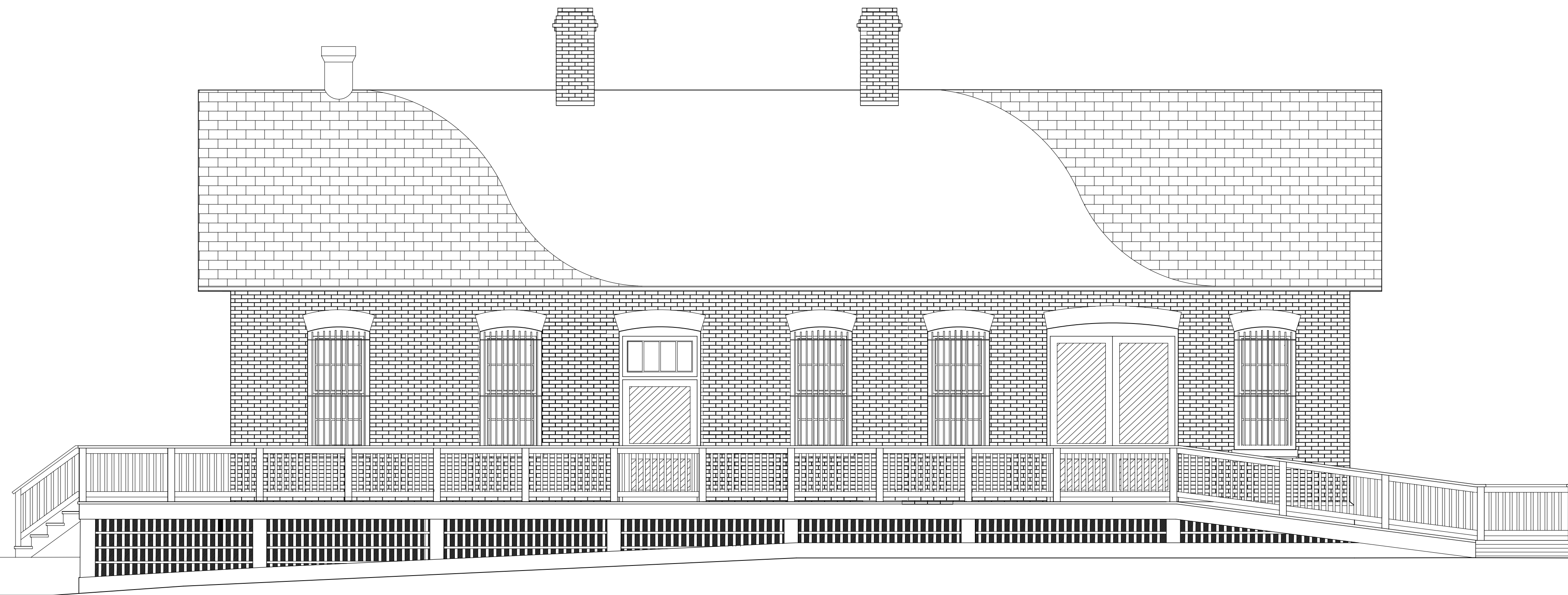
1 EXISTING WEST ELEVATION Scale: 1/4"=1'-0"