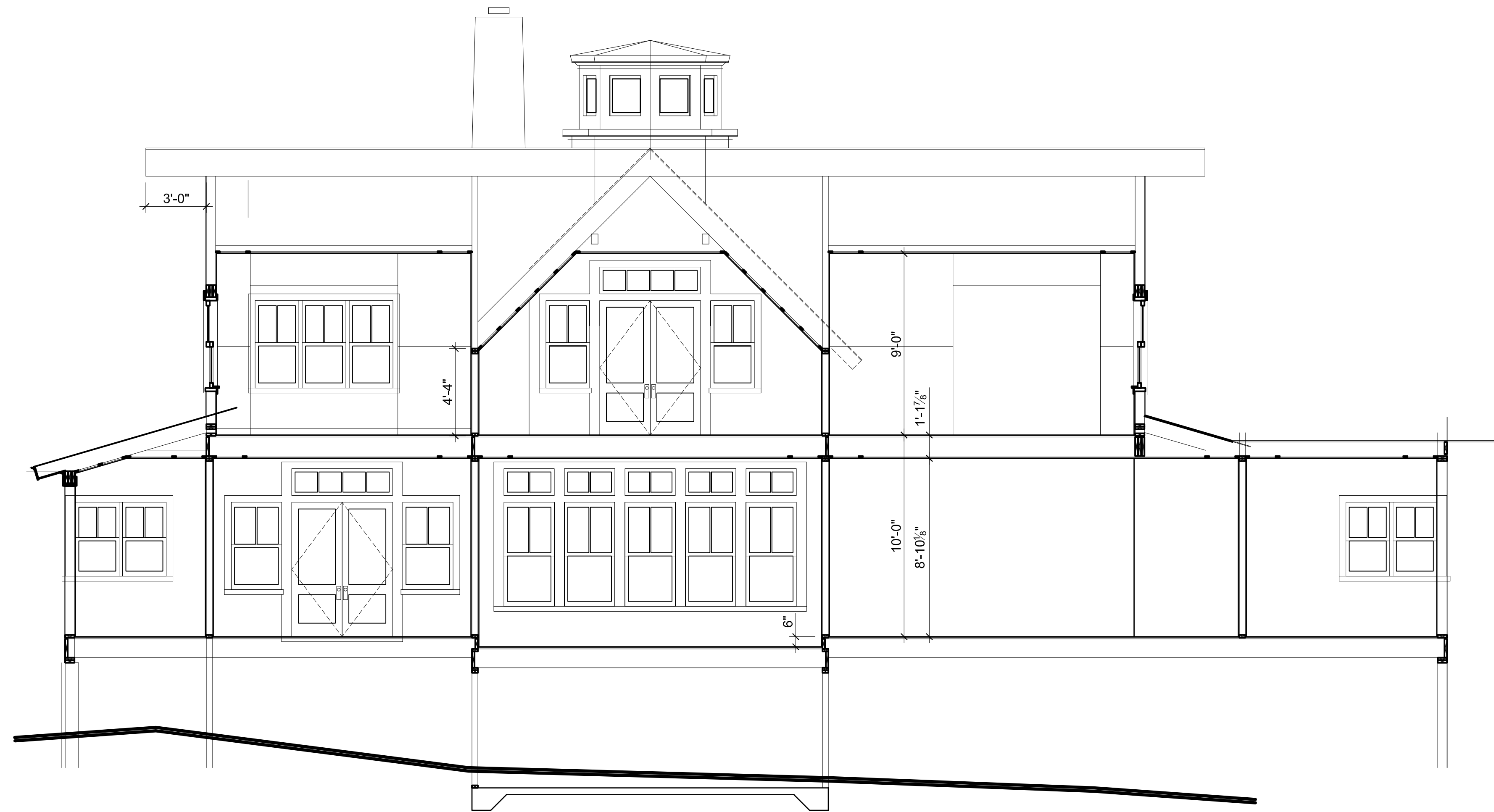
3 SECTION C - THROUGH LONG GABLE 1/4" = 1'-0"