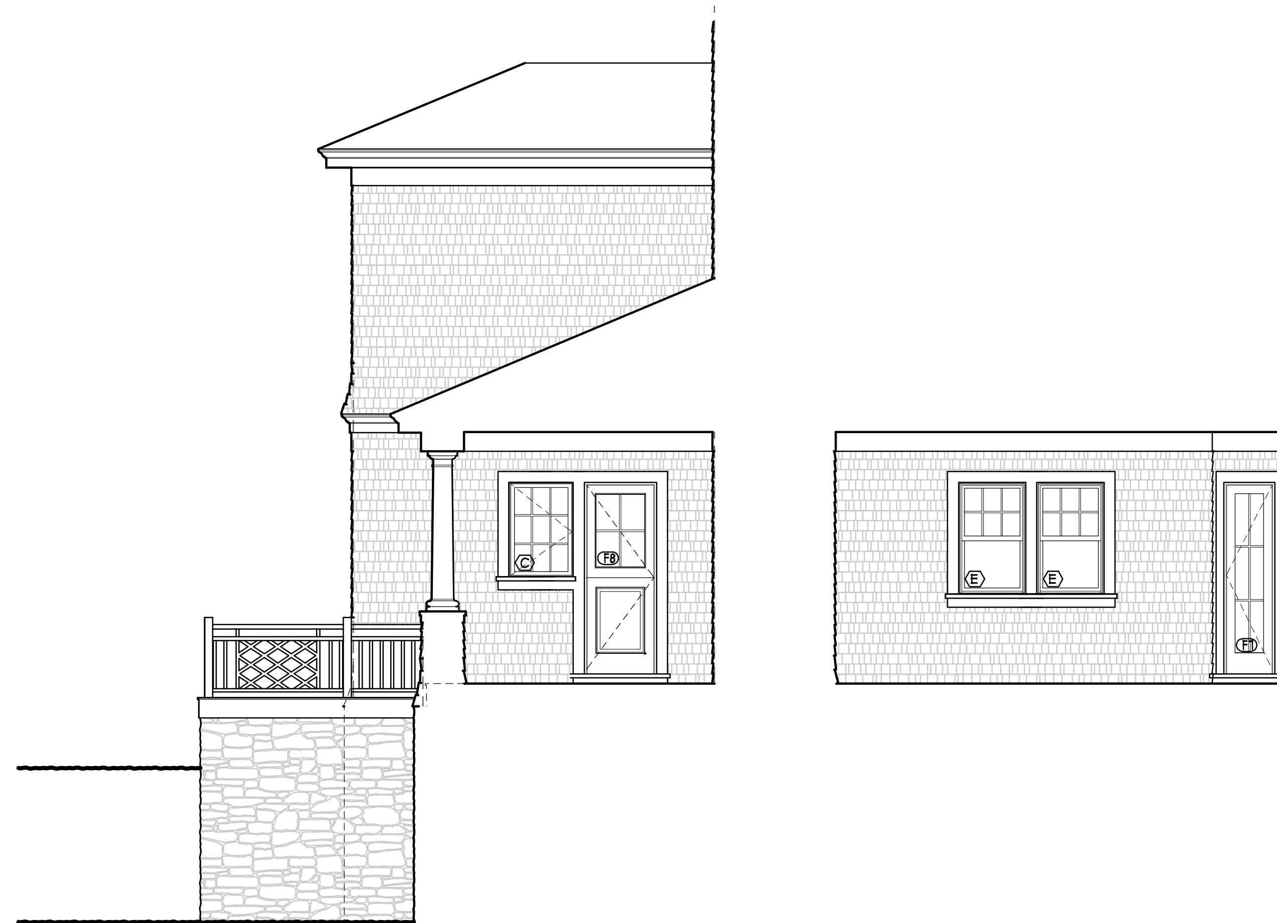
1 ELEVATIONS @ MUD ROOM PORCH A2.6 1/4" = 1'-0"