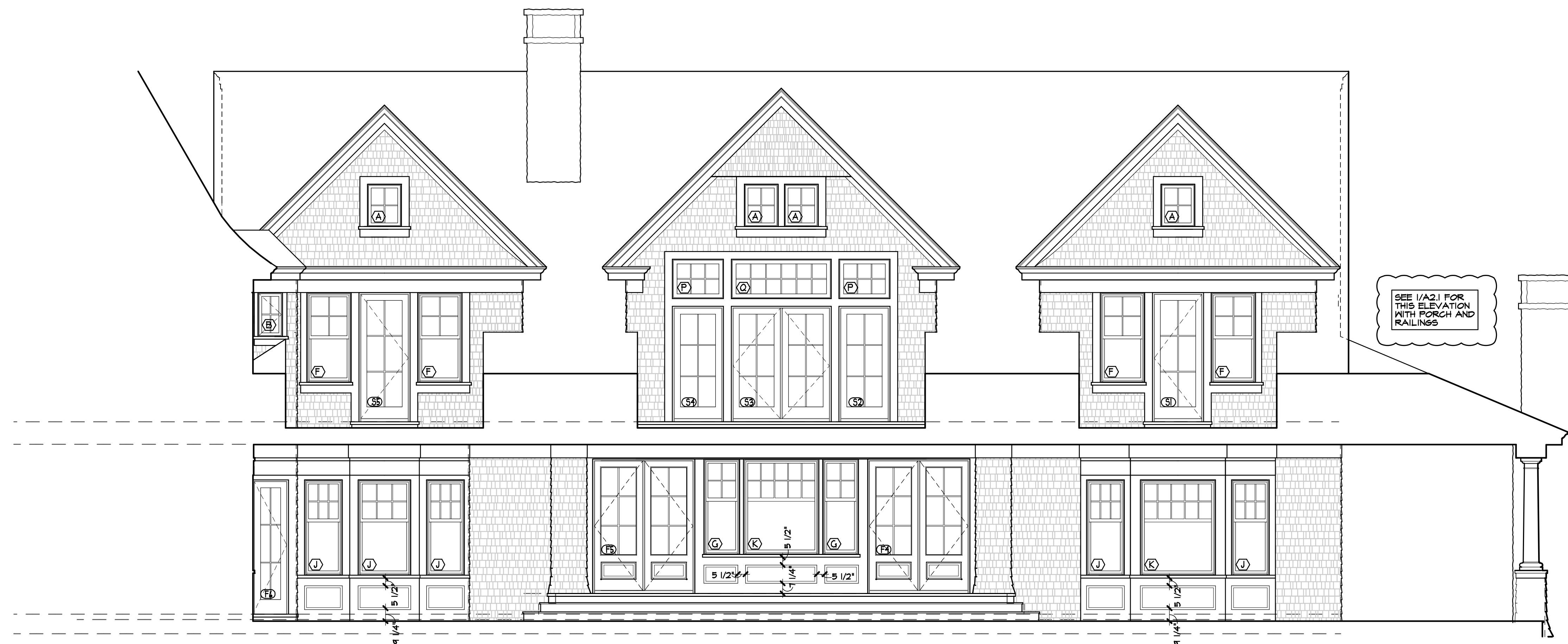
2 ELEVATIONS @ FRONT PORCH A2.5 1/4" = 1'-0"