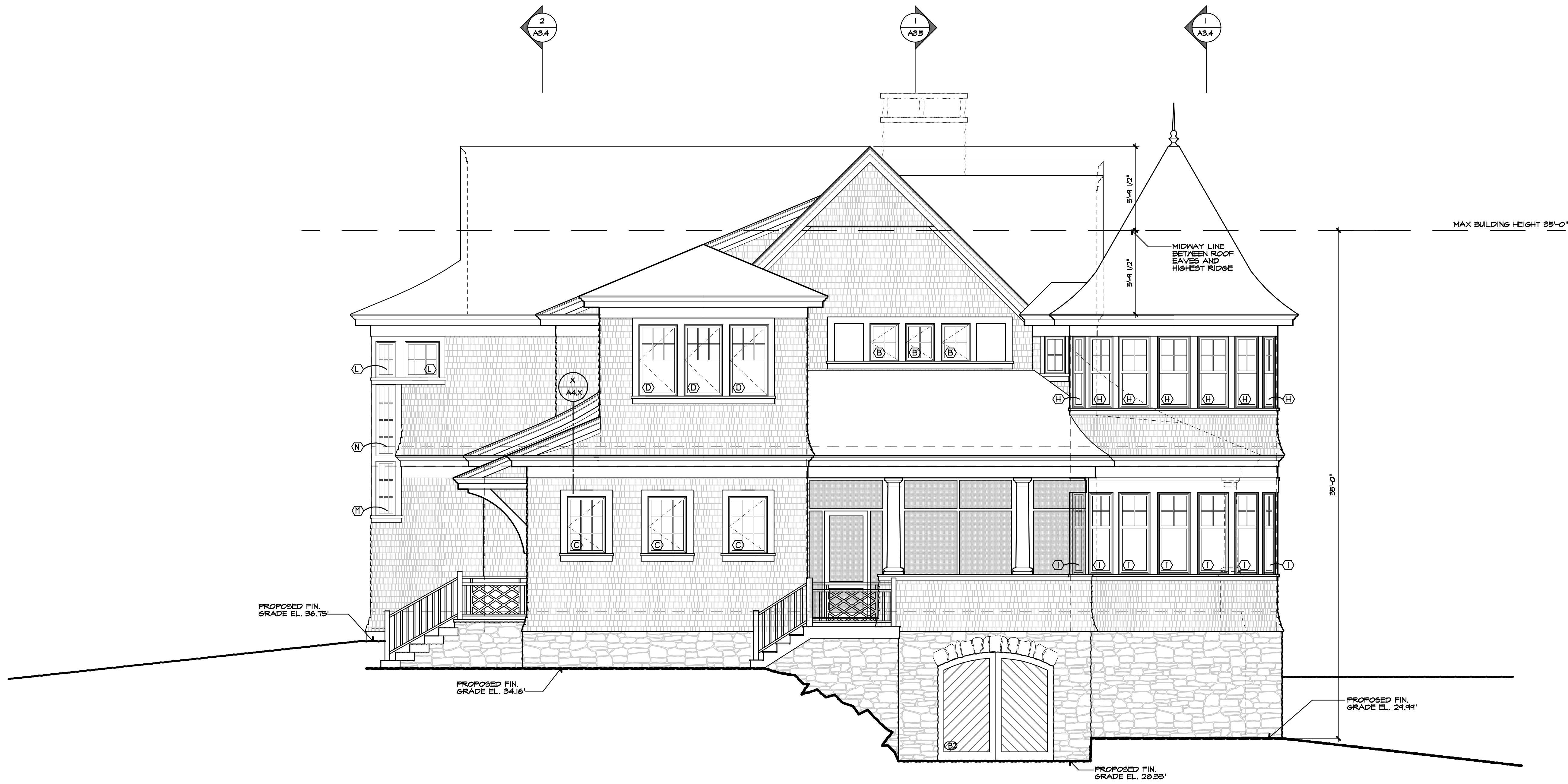
1 ELEVATIONS A2.2 1/4" = 1'-0"