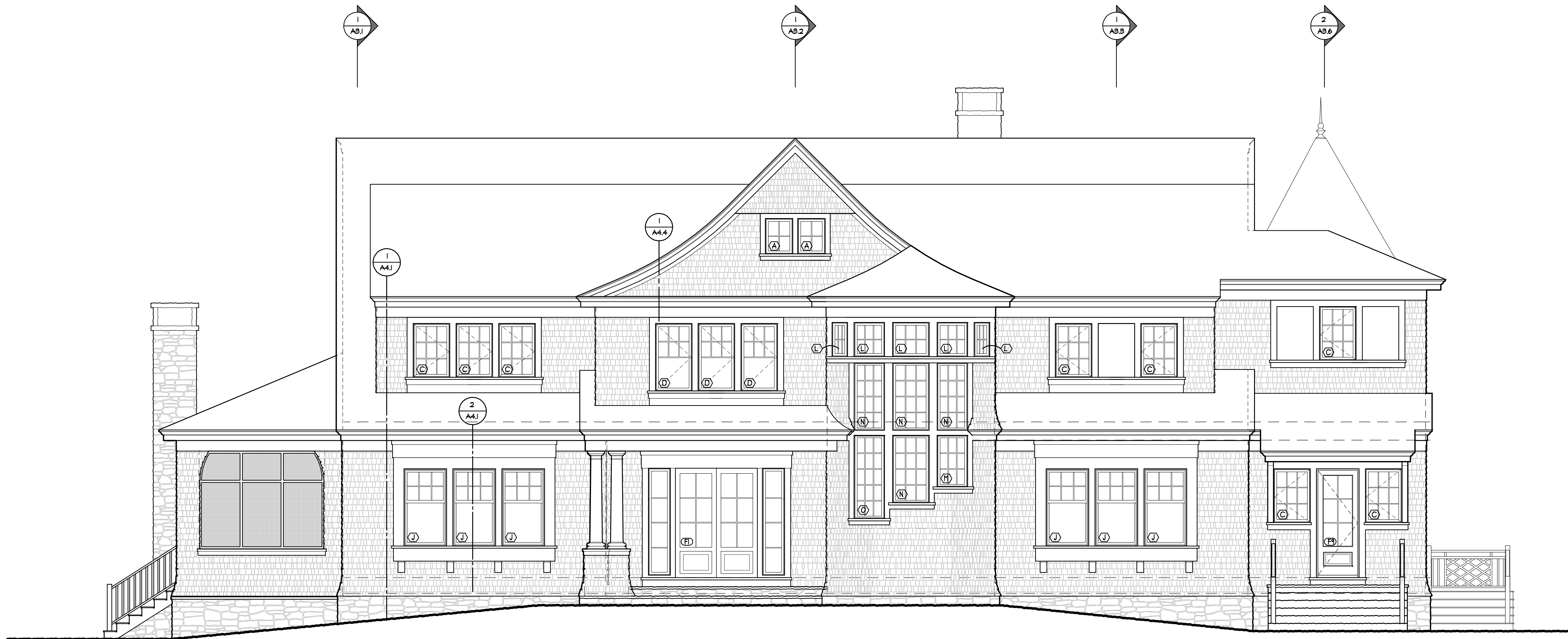
2 ELEVATIONS A2.1 1/4" = 1'-0"