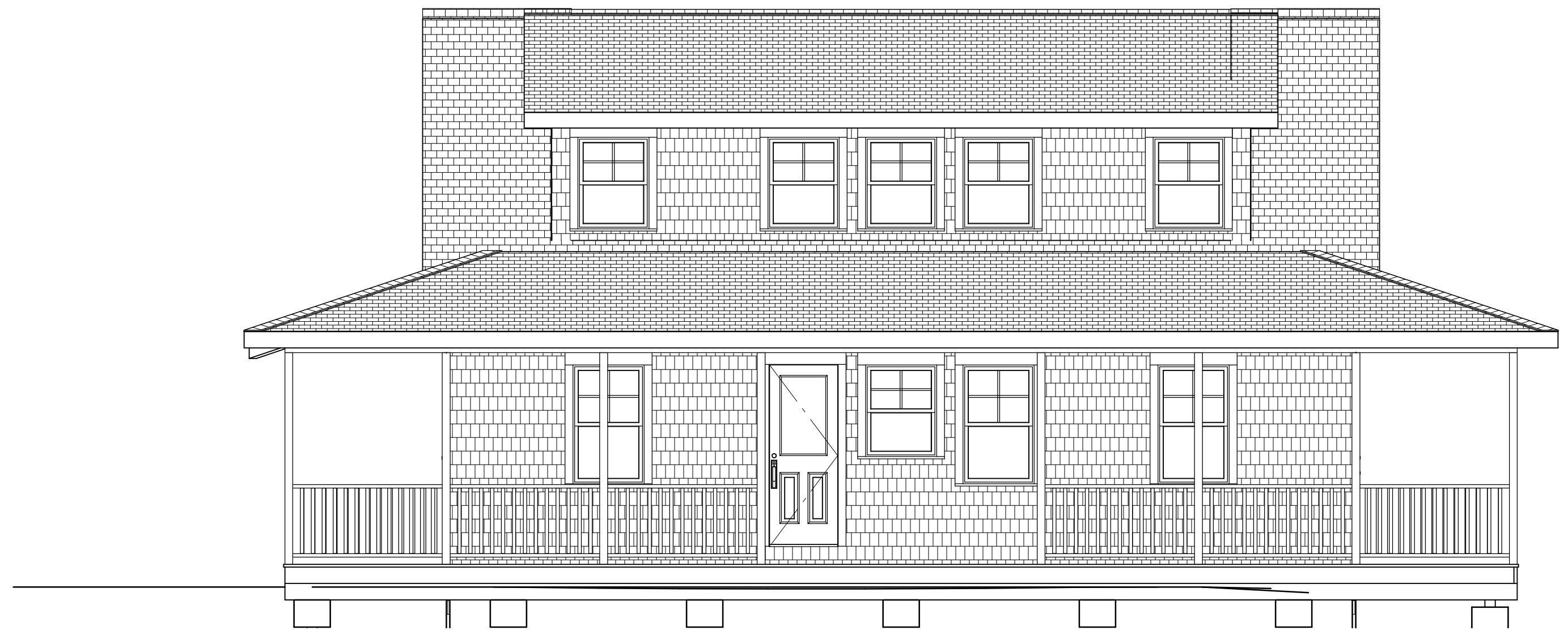
Exterior Elevation Front