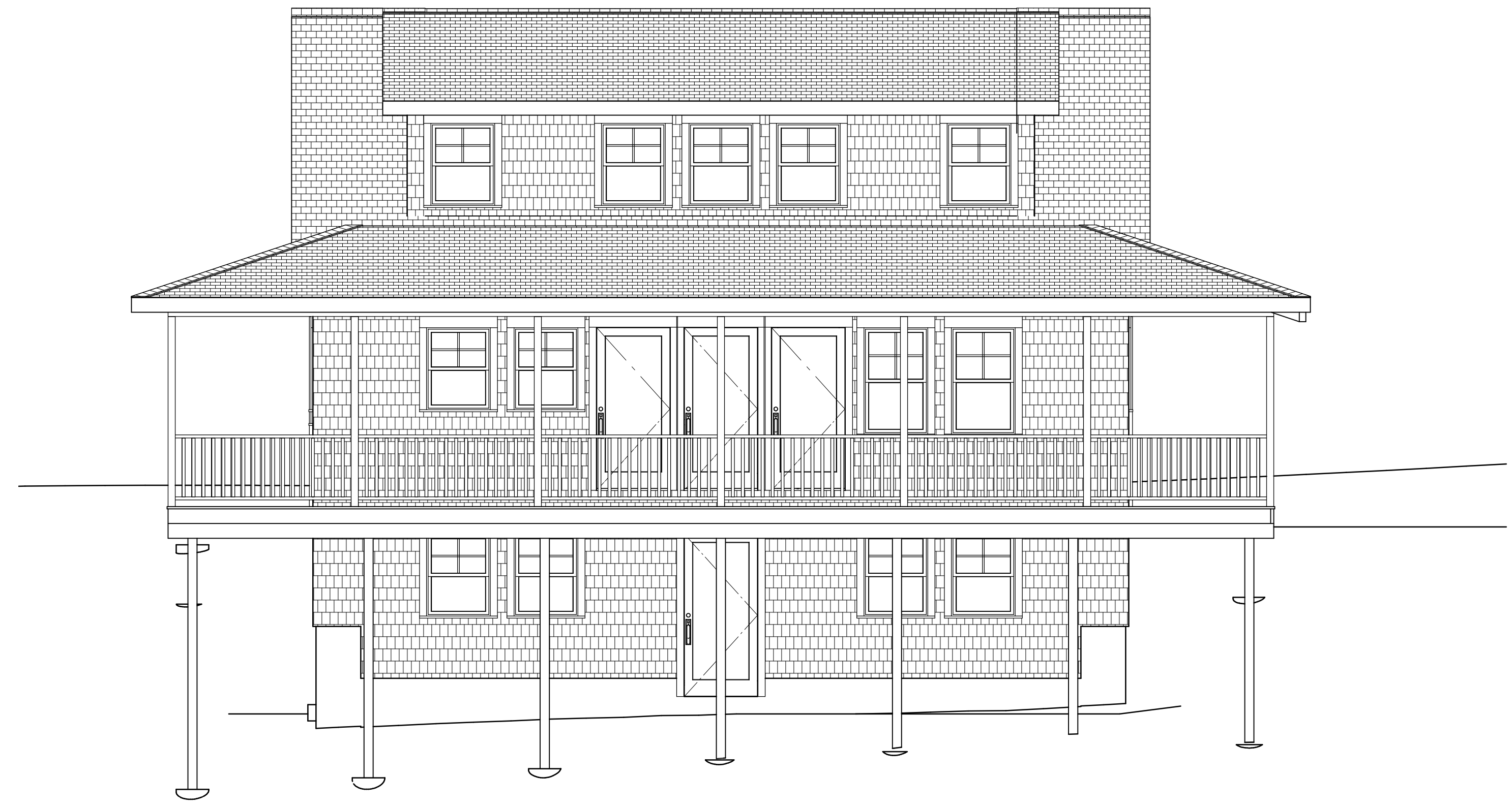
Exterior Elevation Back