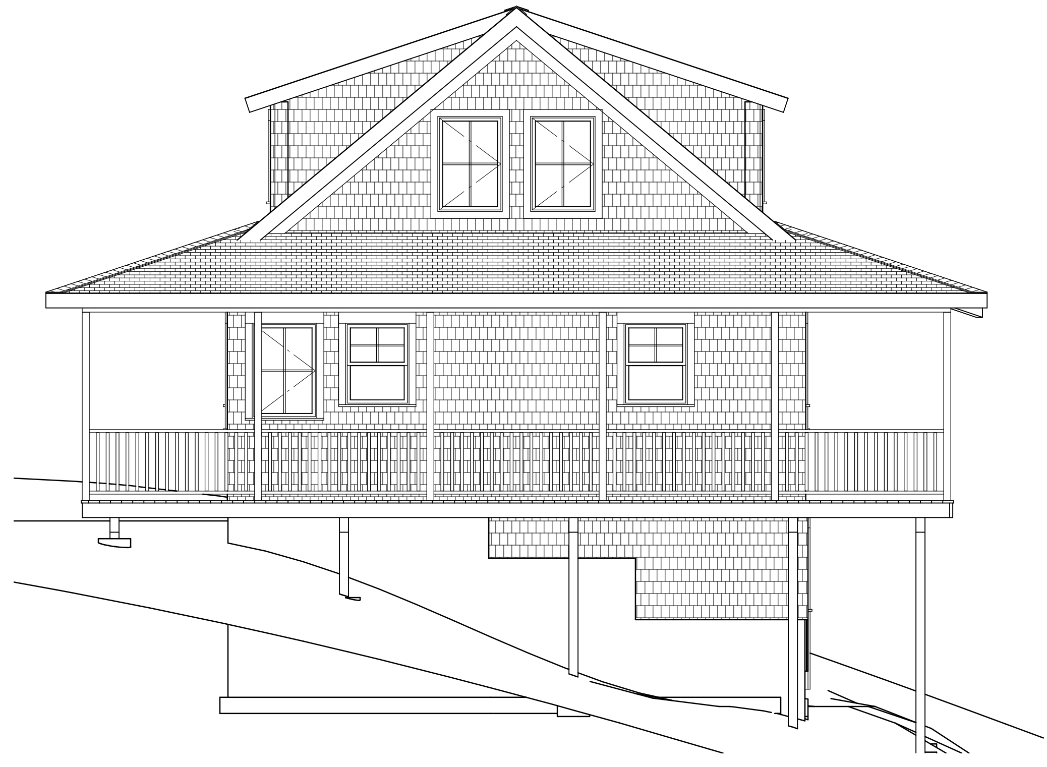
Exterior Elevation Right