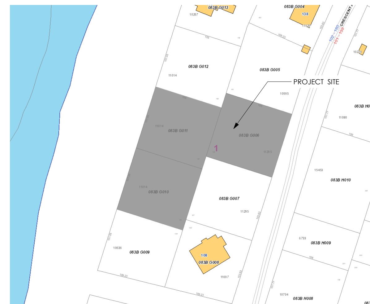
PORTLAND GIS MAP NOT TO SCALE

V:\Volumes\Network Files\C\JAB\PROJECTS\A RESIDENTIAL STUDIO\1 Current Projects\LUEDKE\5 CD\ARCHICAD\Luedke_REV 8 Simple Eave.pln