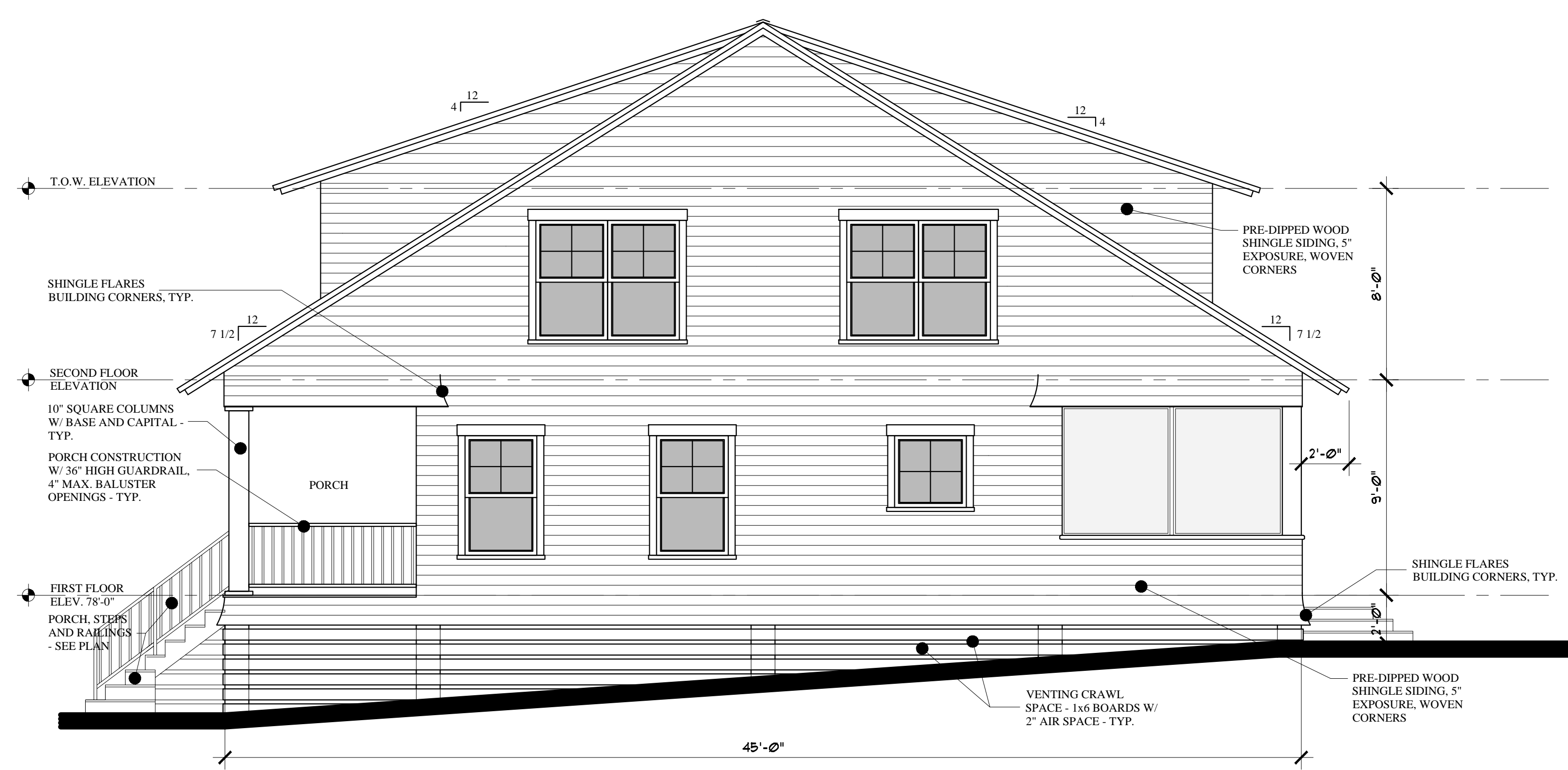
RIGHT ELEVATION SCALE: 1/4"=1'-0"

NOTE: FLASH ALL FASCIAS WITH (2) ROLLS ICE AND WATER SHIELD. FLASH ALL RAKES, AND ROOF/WALL JUNCTURES W/ ICE AND WATER SHIELD