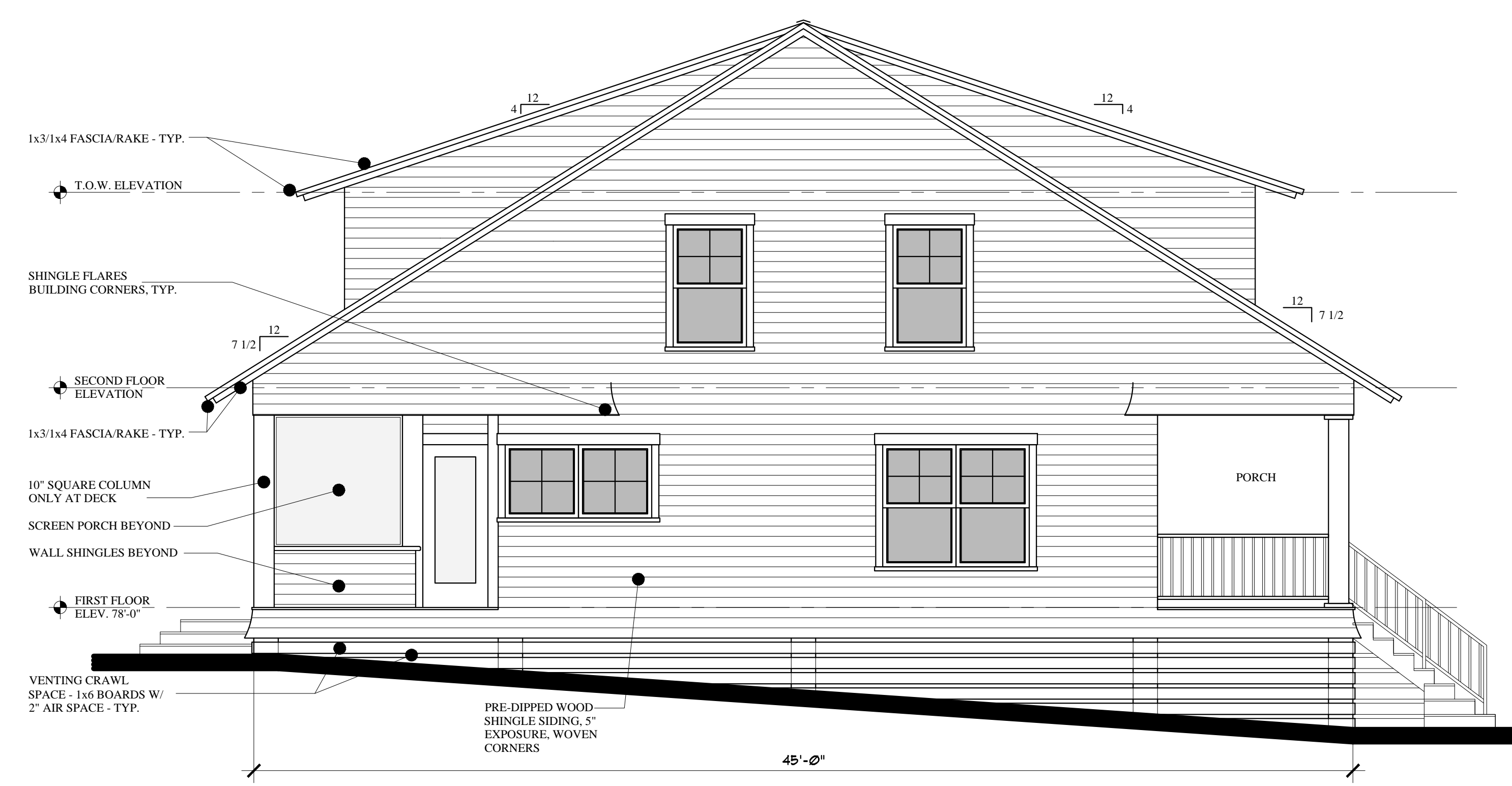
LEFT ELEVATION SCALE: 1/4"=1'-0"