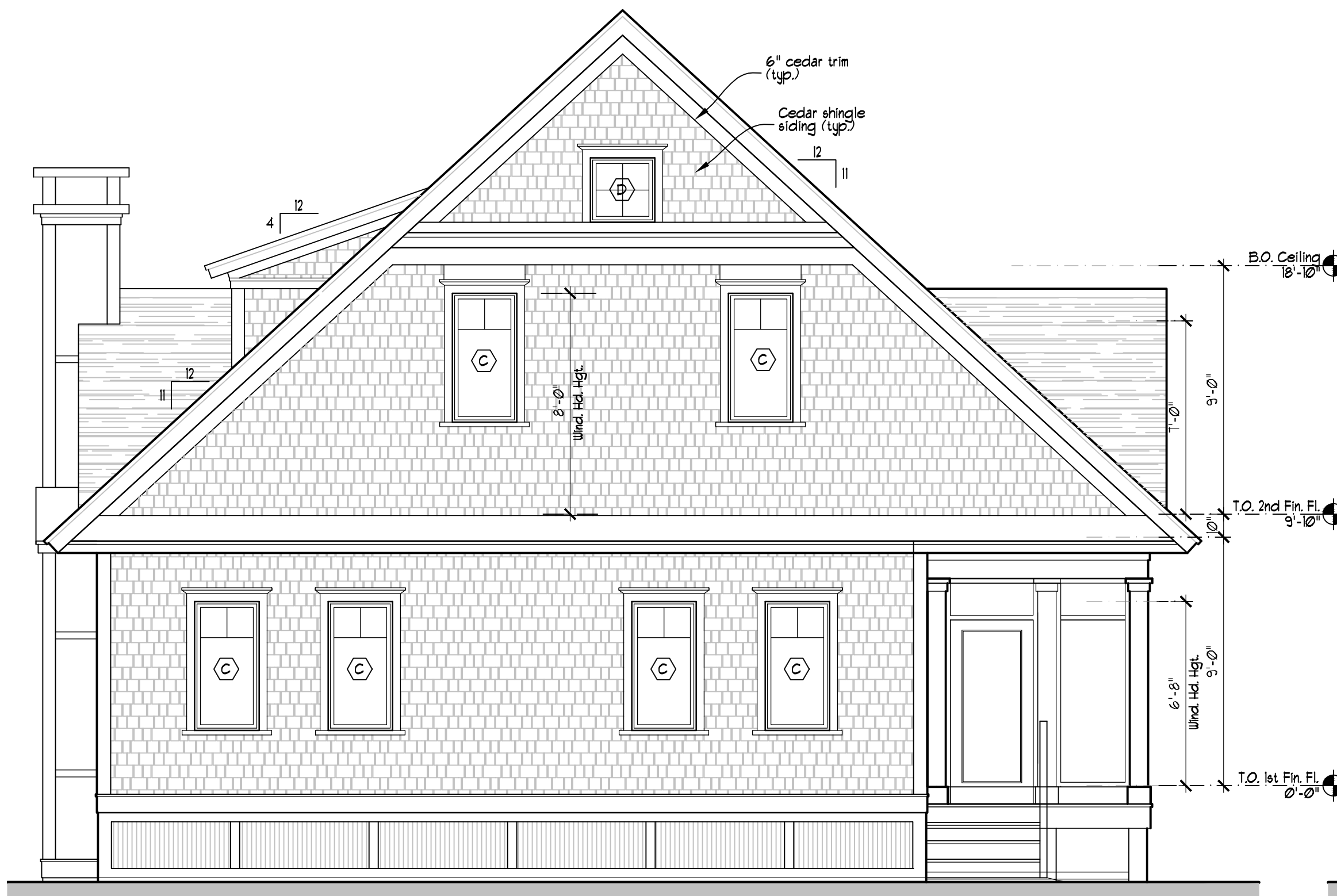
1 REAR ELEVATION SCALE: 1/4" = 1'-0"