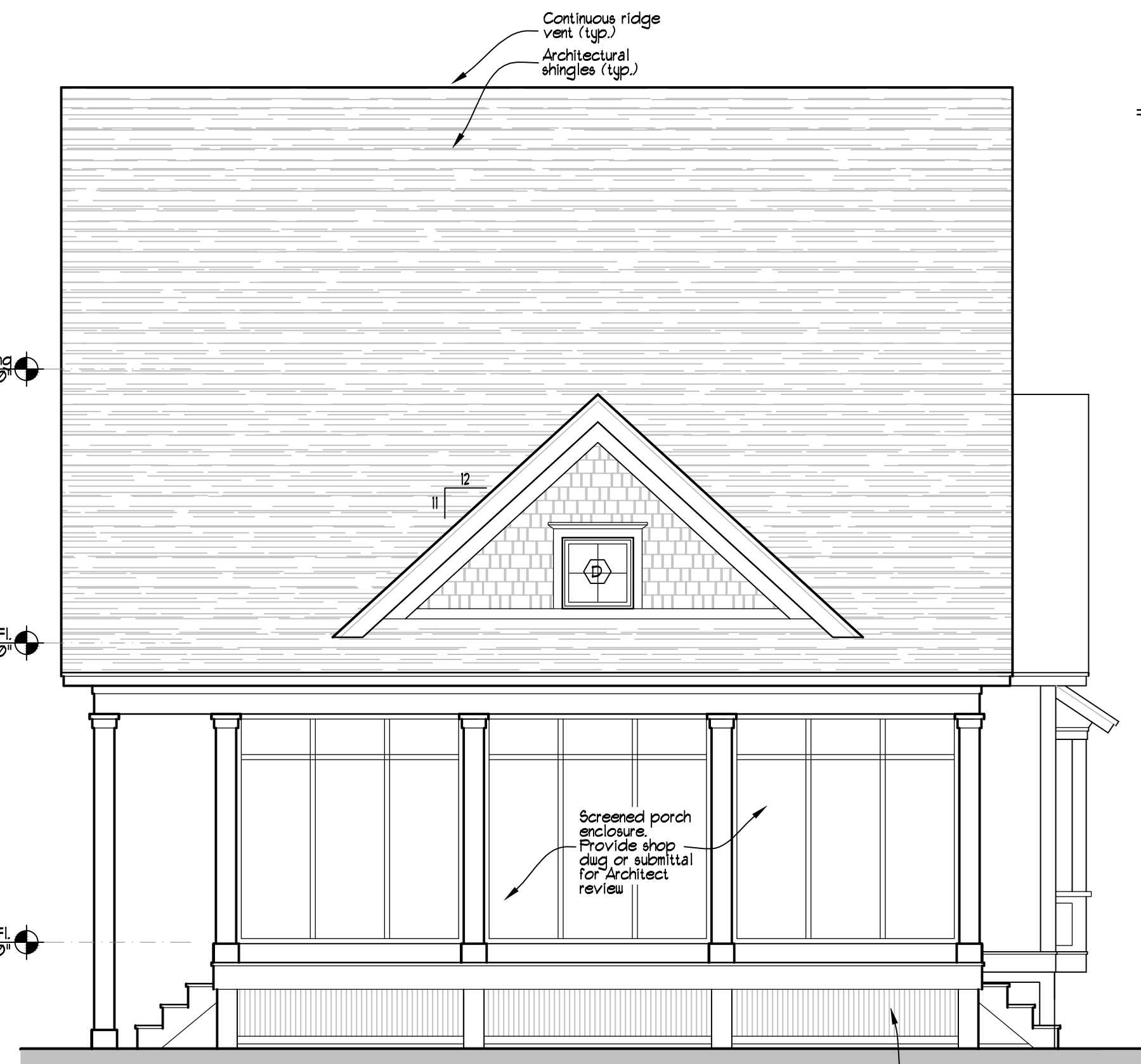
1 LEFT SIDE ELEVATION SCALE: 1/4" = 1'-0"