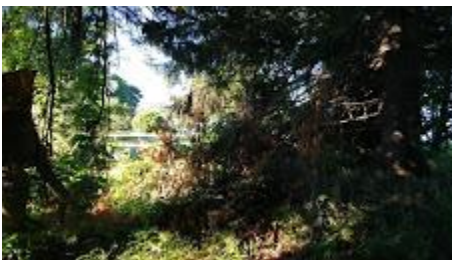
Overgrowth 2b.jpg 188K