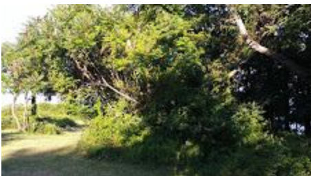
Overgrowth 6.jpg 246K