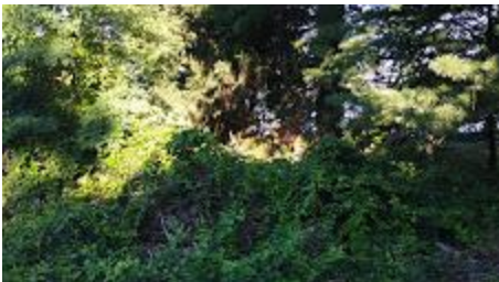
Overgrowth 3.jpg 232K