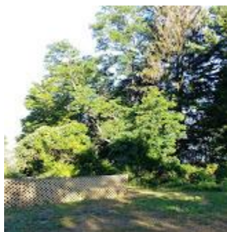
Invasive Growth-Barrier Fence.jpg 346K