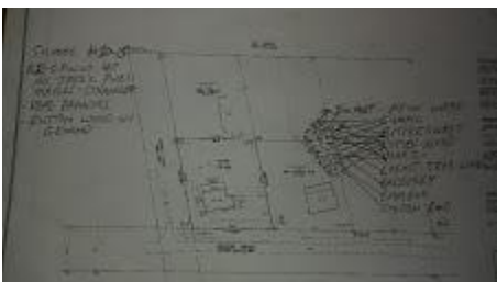
Site Plan GDI 2.jpg 87K