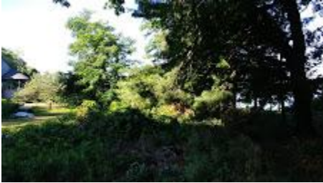
Overgrowth 2a.jpg 167K