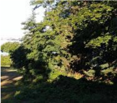
Overgrowth View from Brooks Porch.jpg 274K