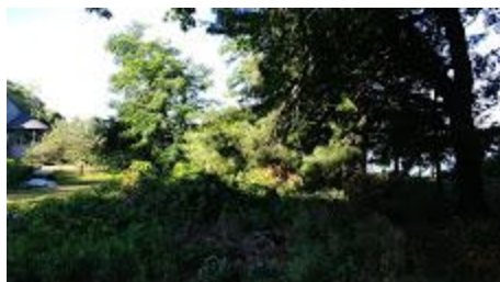
Overgrowth 2a.jpg 167K