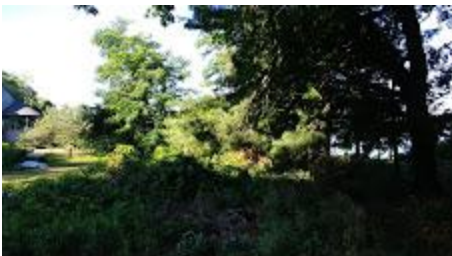
Overgrowth 2a.jpg 167K