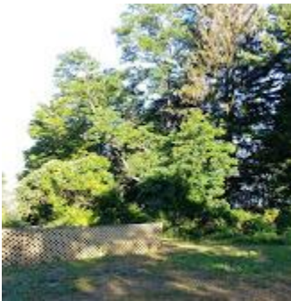
Invasive Growth-Barrier Fence.jpg 346K