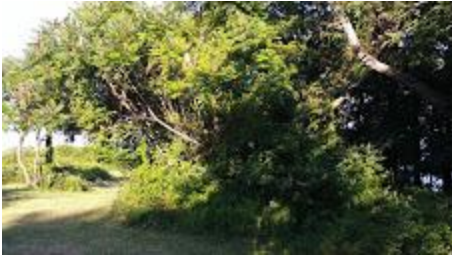
Overgrowth 6.jpg 246K