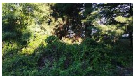
Overgrowth 3.jpg 232K