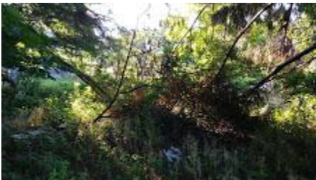
Overgrowth 5.jpg 225K