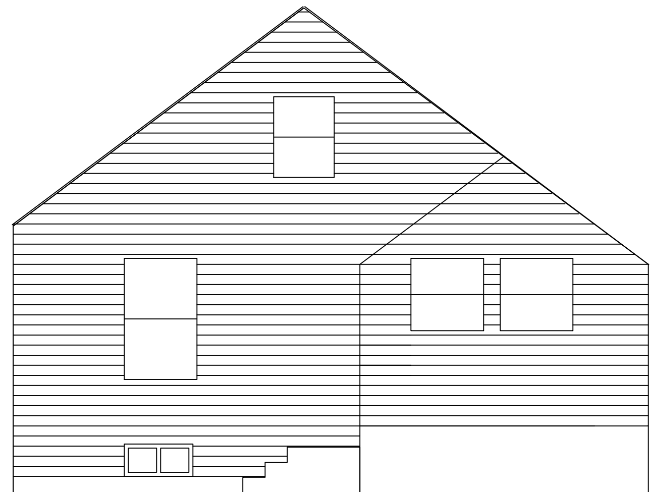
SOUTH 1/4" = 1'-0"