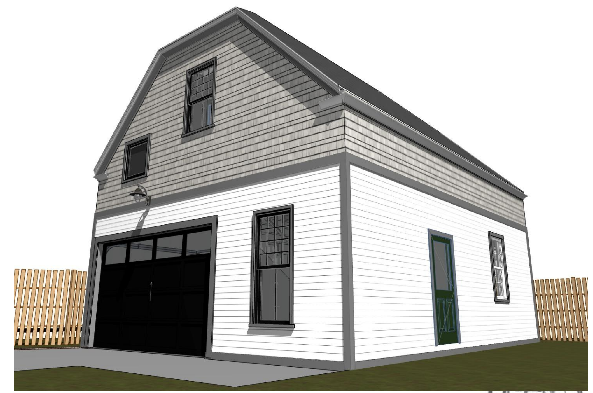
5 VIEW FROM BACK ENTRY OF HOUSE