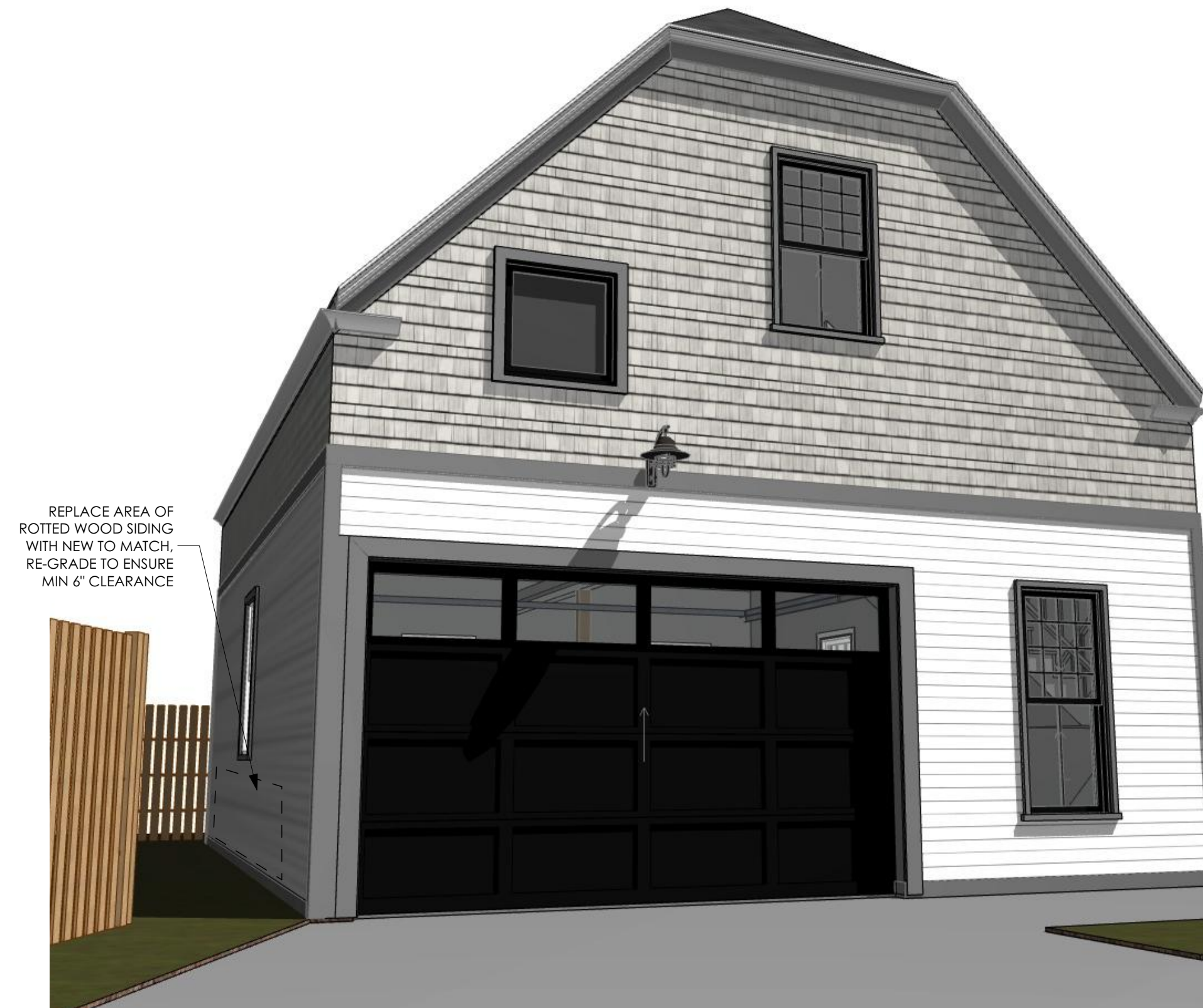
4 VIEW FROM FRONT APPROACH