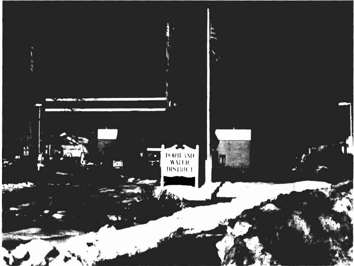
PWD Customer Parking Lot Facing Brighton Avenue Showing Location Of Existing Sign and Flag Pole Where Proposed Banner Will Be Installed.

Photos showing location of existing sign and existing flag pole where proposed banner will be installed at 225 Douglass Street.