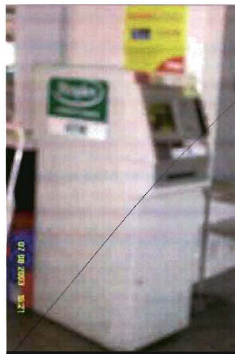
Existing ATM Decal - 11-1/2" x 17-1/2"

NOTES Plex face with applied 3M Scotchcal #VQ-10019 Dk green vinyl background, applied 3M Scotchcal #VQ-10018 light green vinyl rule line, 3M Scotchcal 3650-10 trans white vinyl.