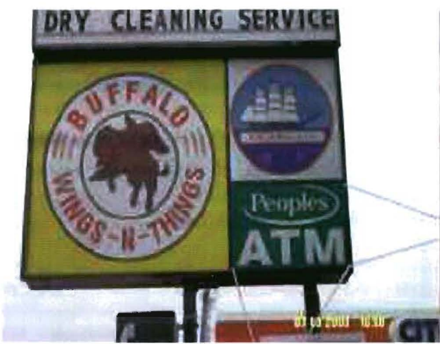
Existing D/F Tenant Pylon - 24" x 36"

RC#01831029 1199 CONGRESS STREET PORTLAND, ME