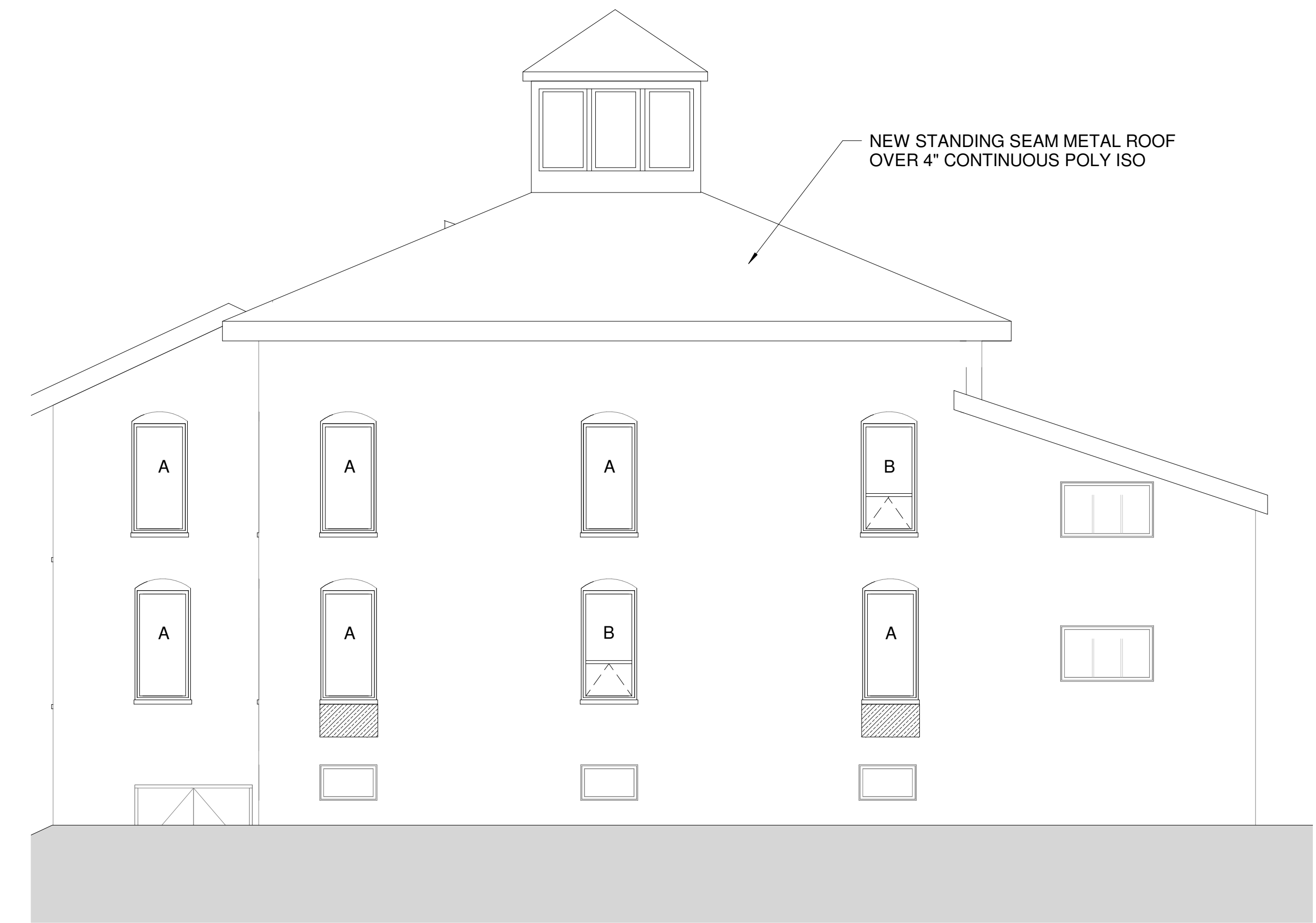
2 | MAIN HOUSE EAST 3/16" = 1'-0"