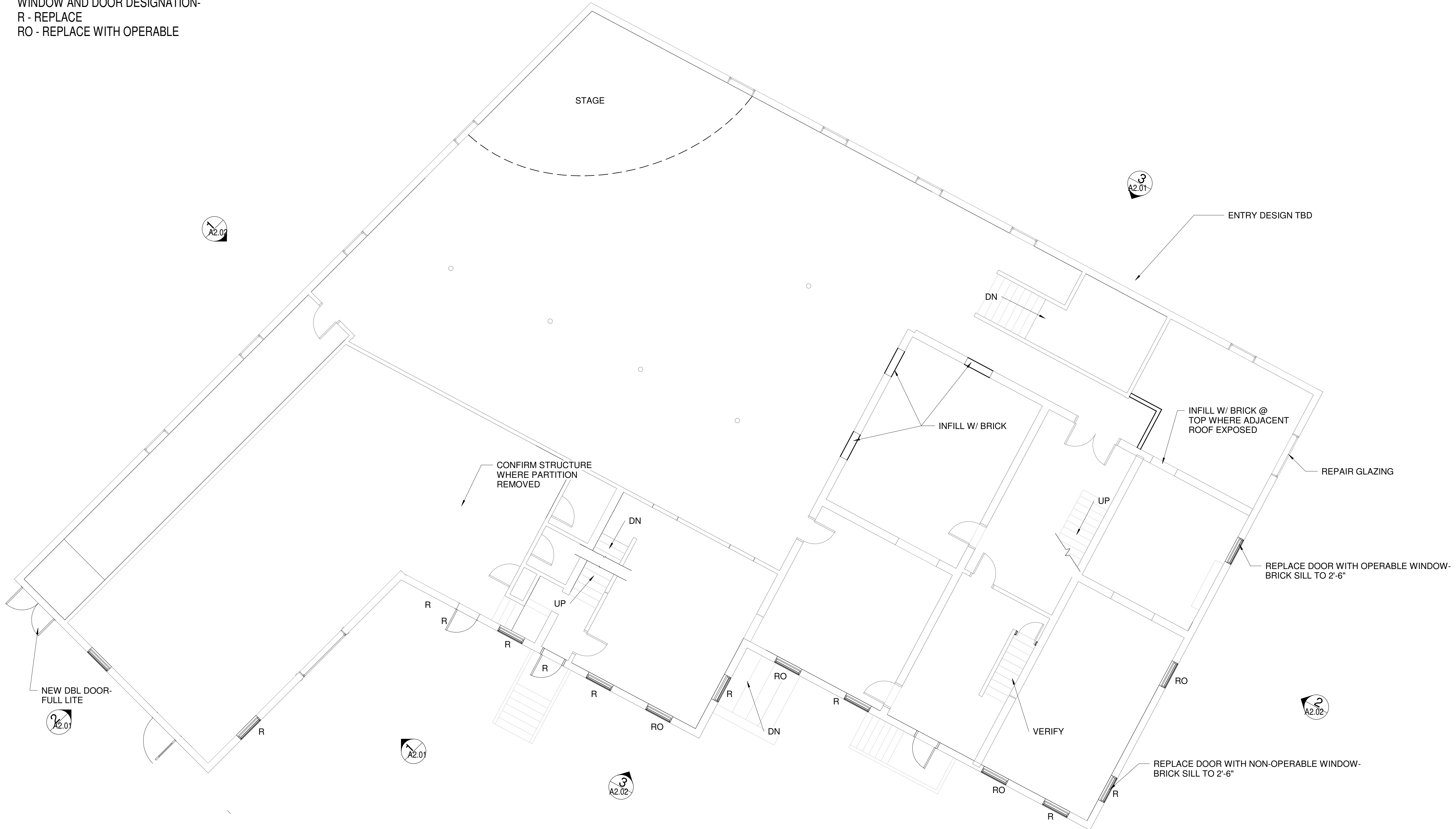
1 | FIRST FLOOR - NEW 3/16" = 1'-0"