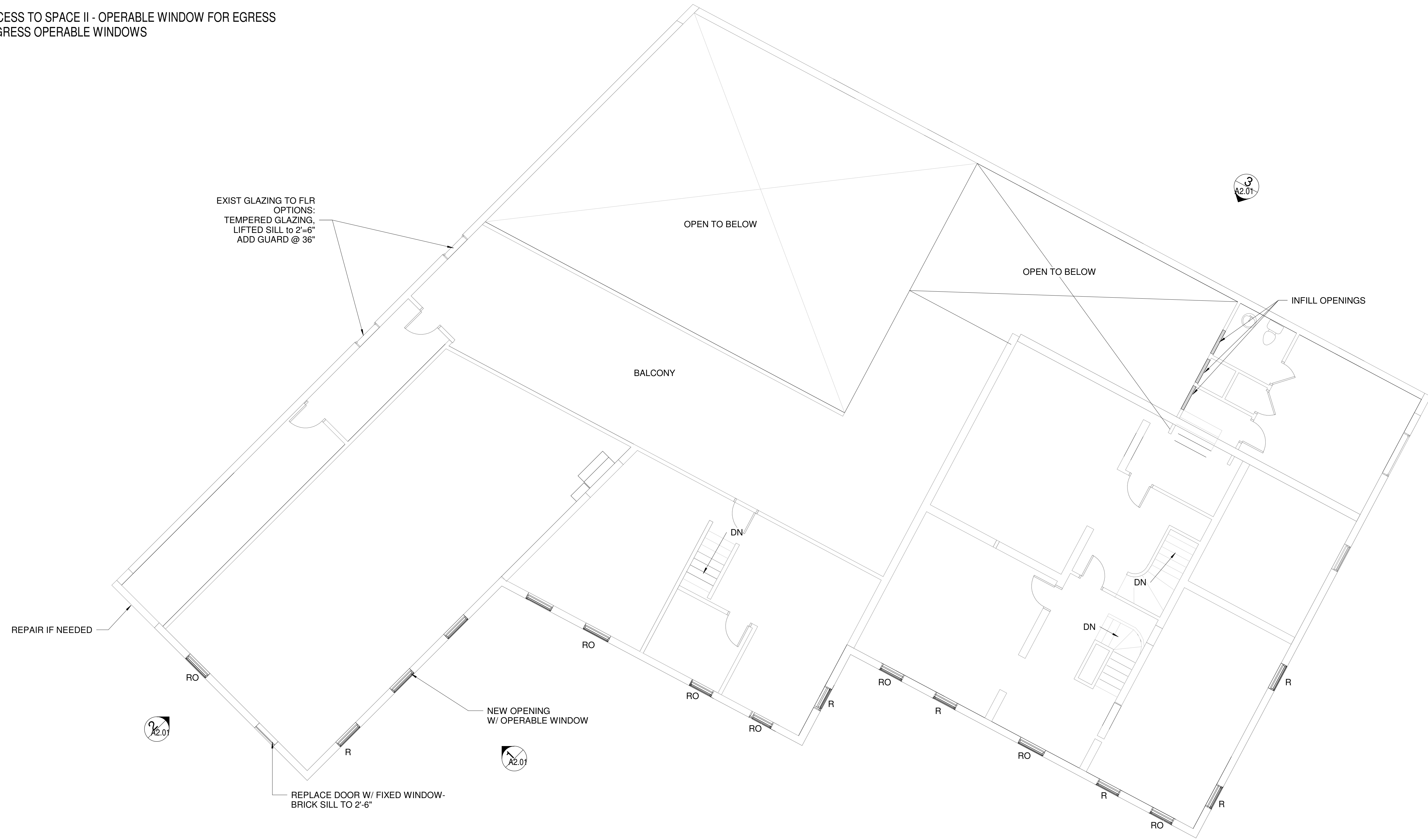
1 | SECOND FLOOR - NEW 3/16" = 1'-0"