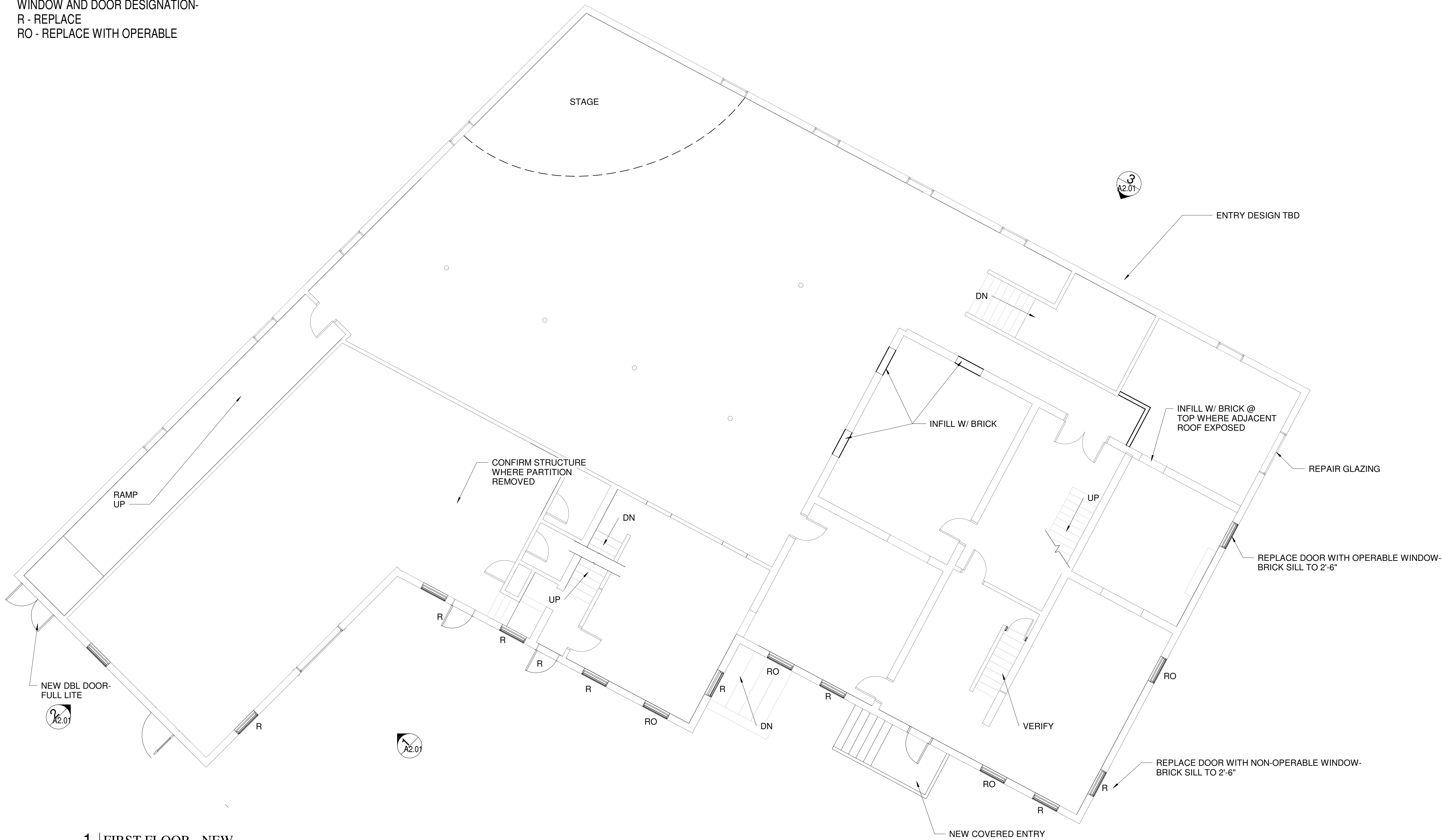
1 | FIRST FLOOR - NEW 3/16" = 1'-0"