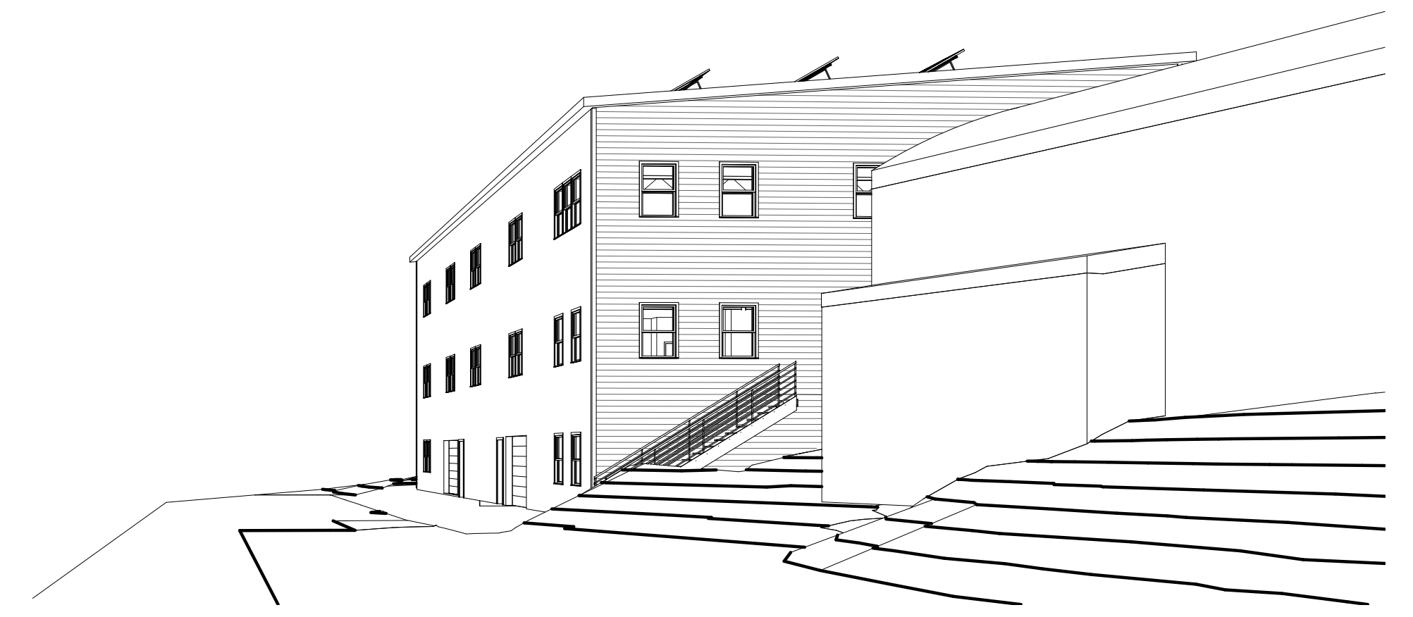
(B) LOWER CASSIDY