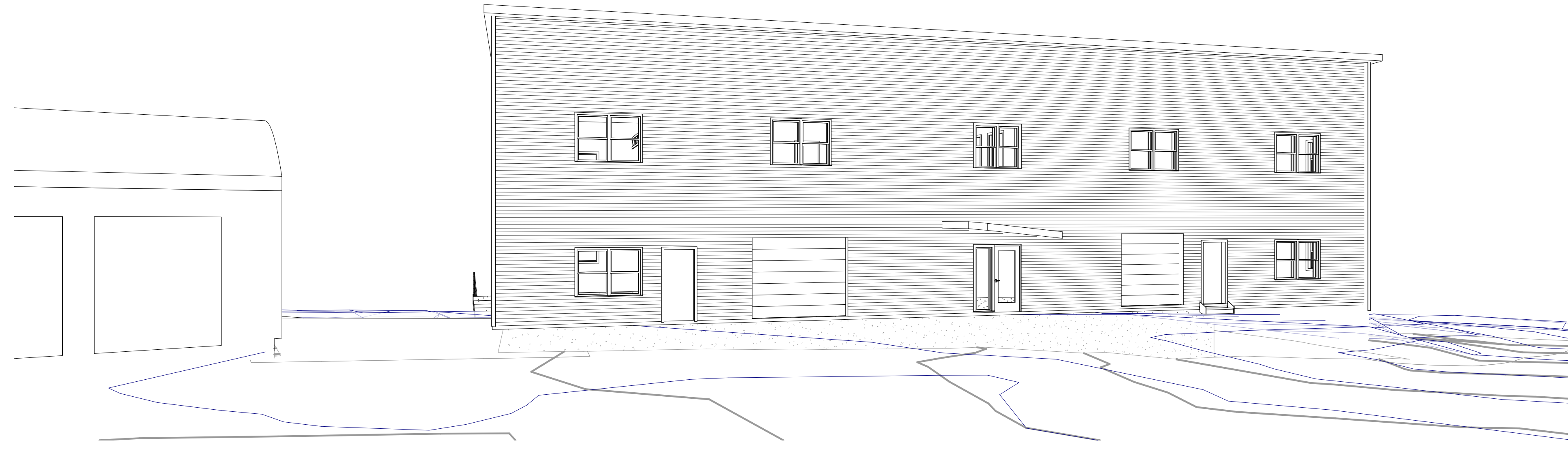
(A) UPPER CASSIDY PERSPECTIVE