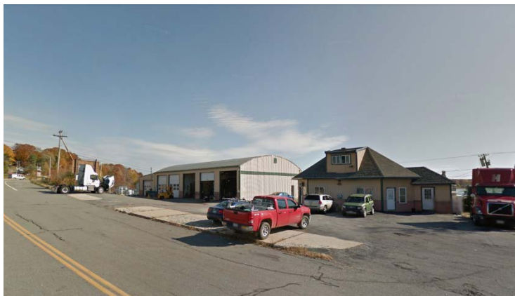
Figure 2: Site at present with wood frame building at right and metal building at left

The former CoachWorks site consists of two separate structures, including a 5,237 square foot metal building constructed in 1924 that features 6 large overhead doors along and a smaller 1,666 square foot two-story wooden structure constructed in 1910. The current use of the property is auto and truck repair with an office on the upper level of the wood frame structure. Other current uses of this property include boat repair, boat storage, auto parts, auto body repair shop, storage of fishing equipment and multi-use storage. The majority of this lot is paved.