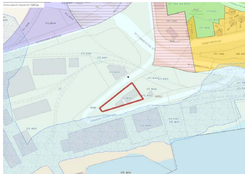
Figure 1: Proposed development site with zoning context

A total of thirty-eight (38) notices were sent to property owners within 500 feet of the site and interested party list. A legal ad ran on July 2 nd and 3 rd , 2018 of the Portland Press Herald. As of the writing of this report, no public comments have been received by the Planning Office.