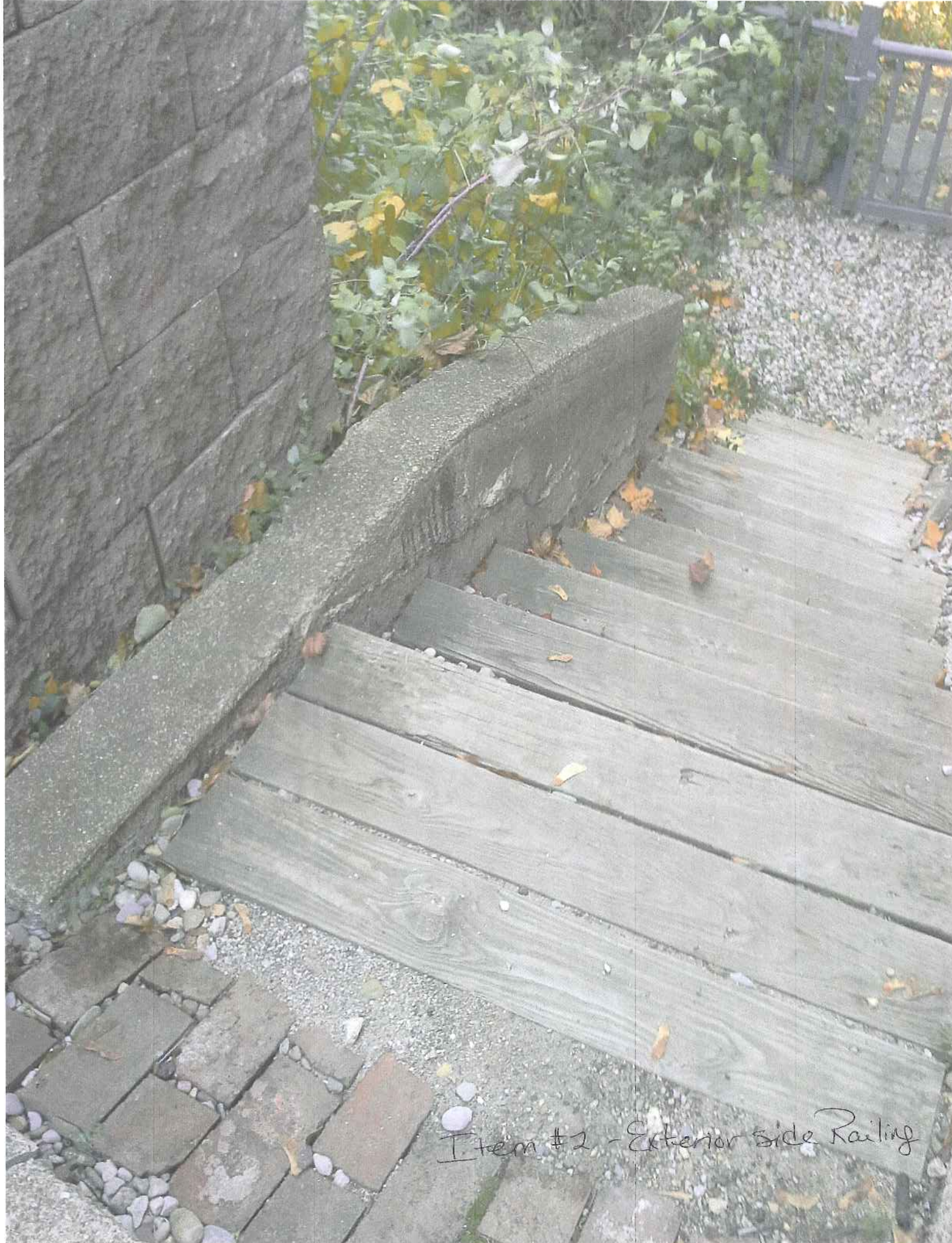
Item #2 - Exterior side Railing