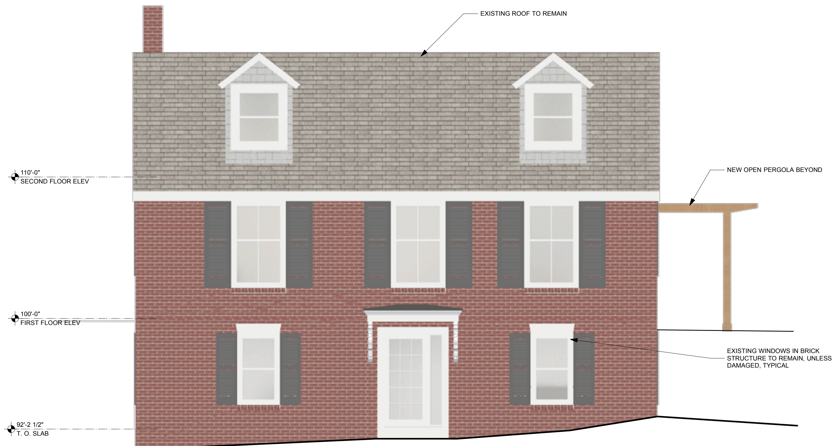
1 Front Elevation Scale: 1/4" = 1'-0"