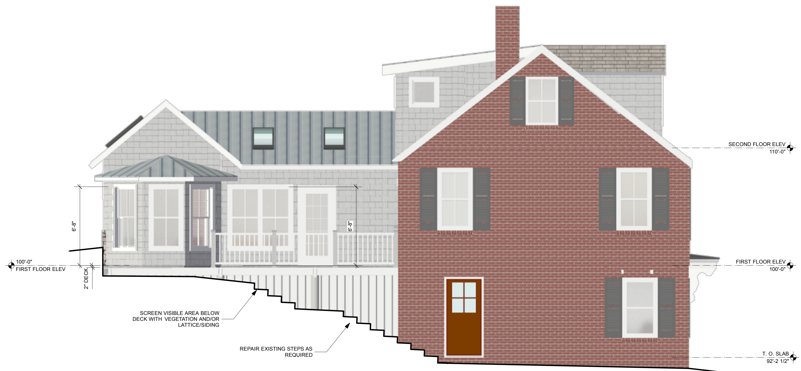
2 Left Elevation Scale: 1/4" = 1'-0"