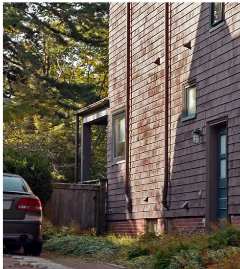
2 Close up, Photoshop image with new awning unit