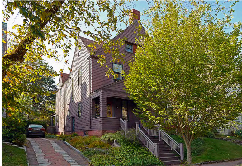
2a Photoshop image with new awning unit in place