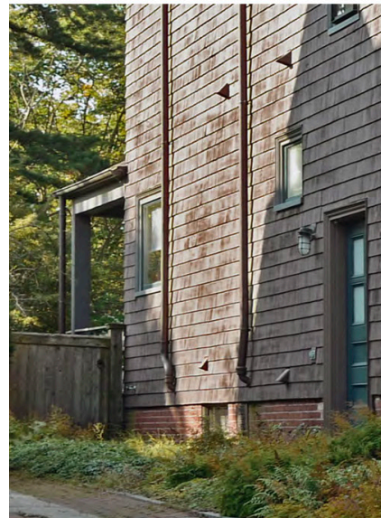
existing window detail