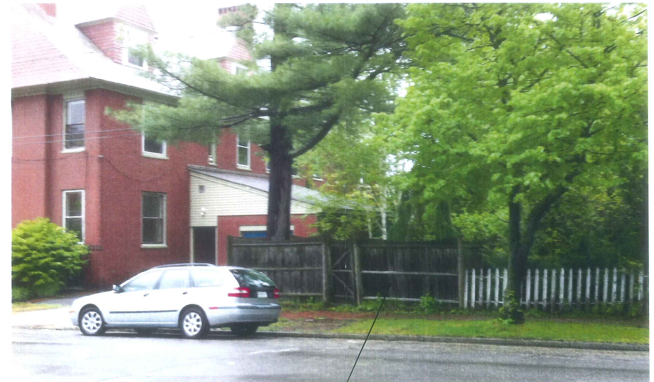
Existing 6' high fence to be replaced (Chadwick Street elevation)