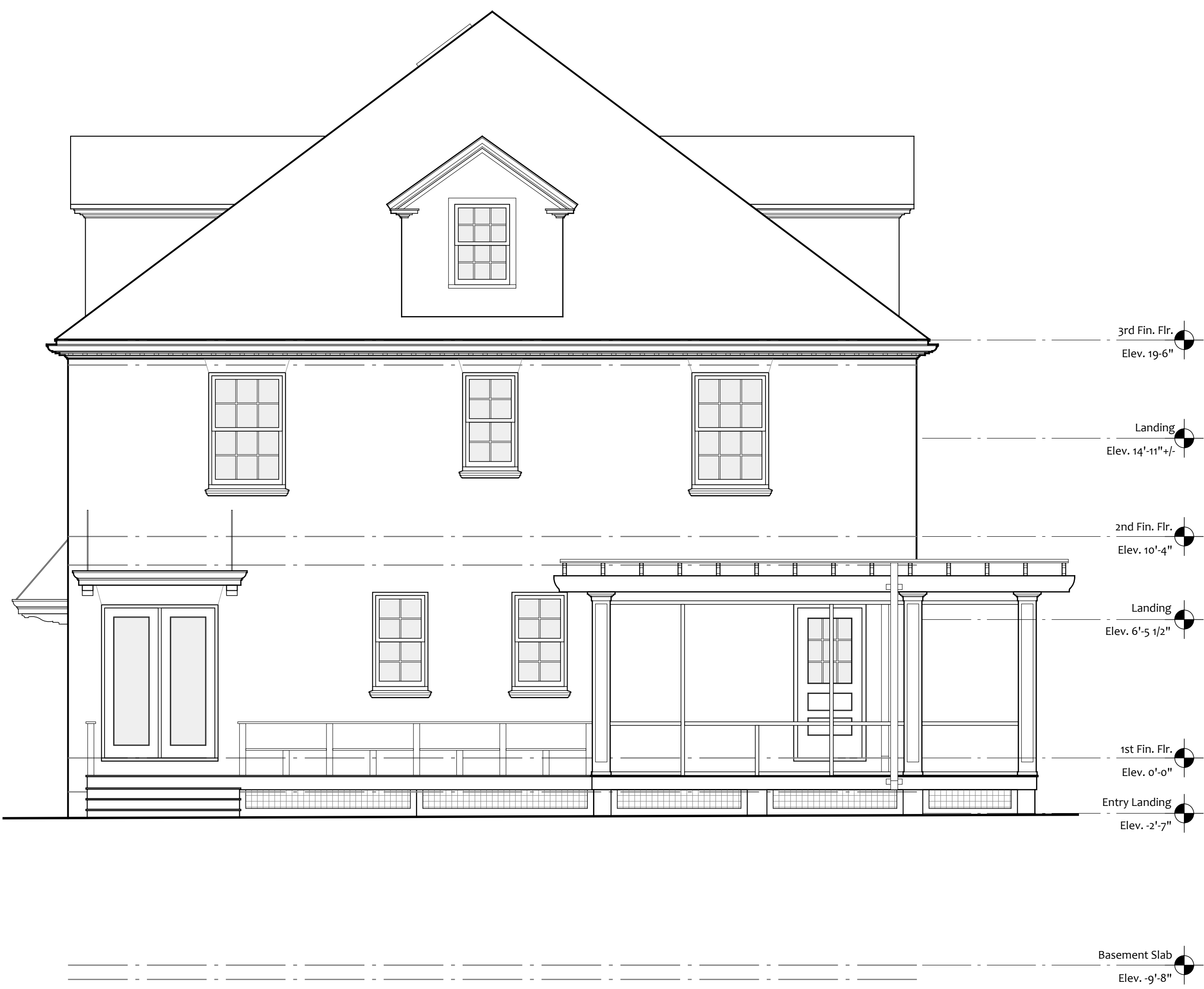
3 West Elevation