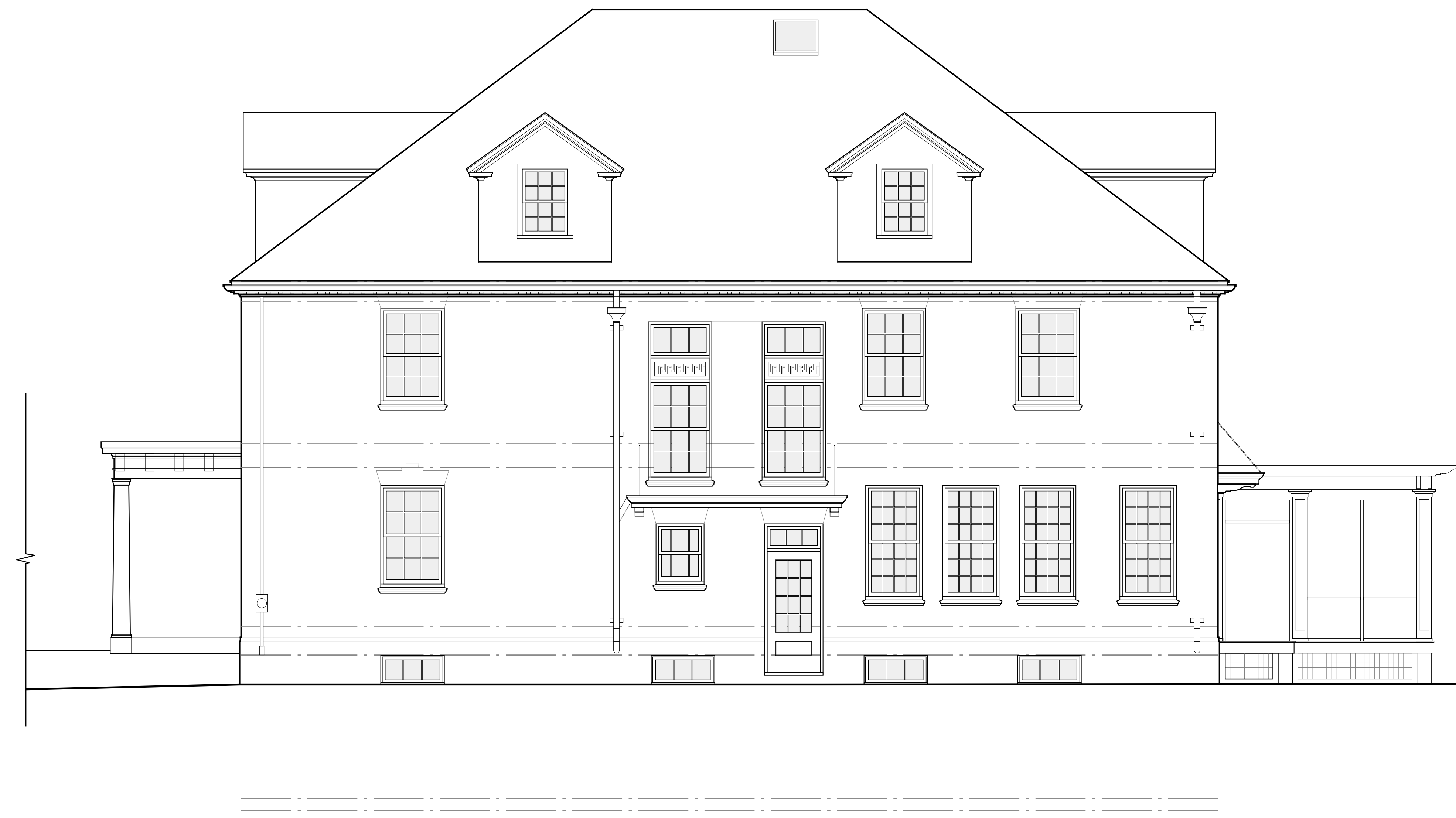
4 North Elevation