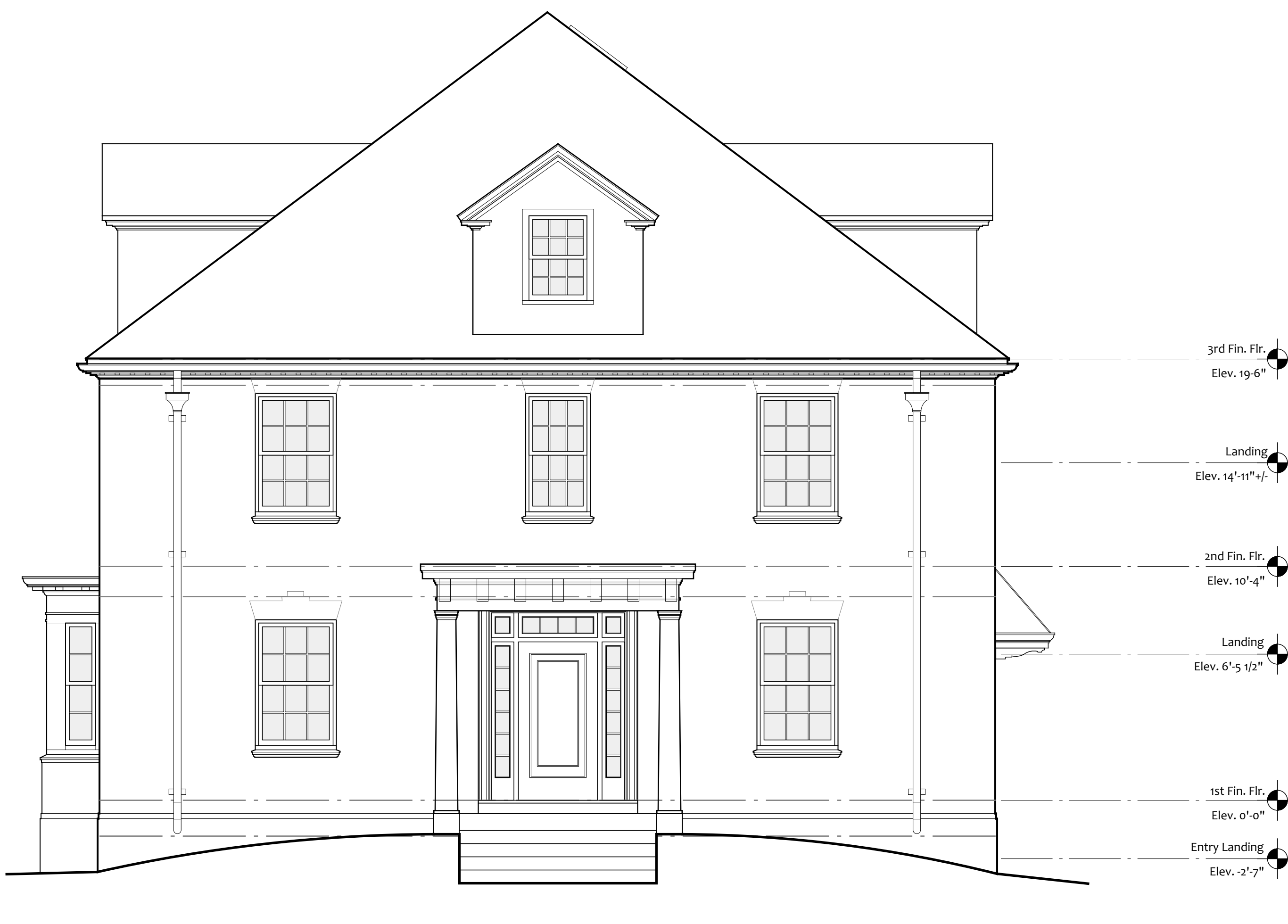
2 East Elevation