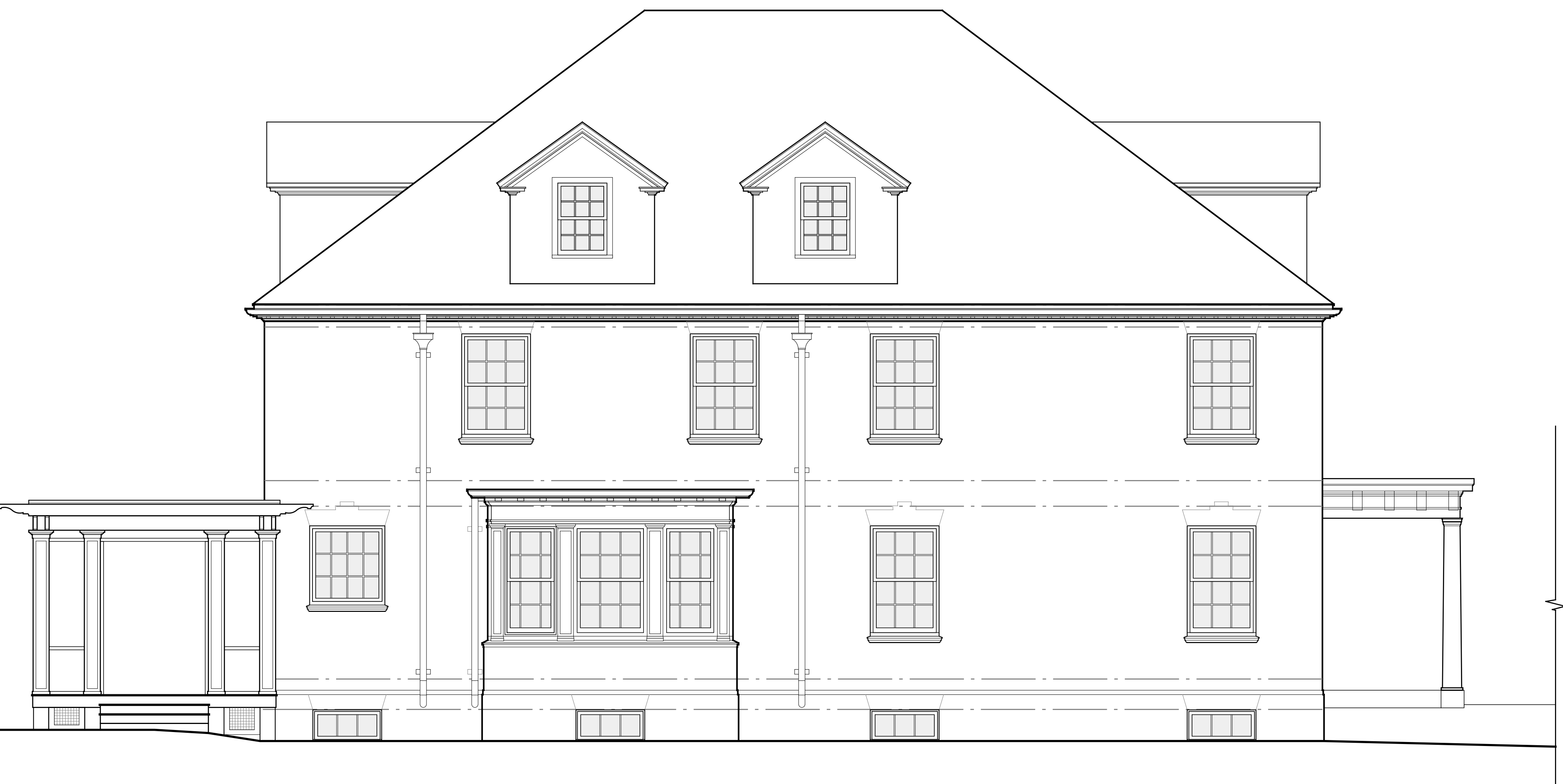
1 South Elevation