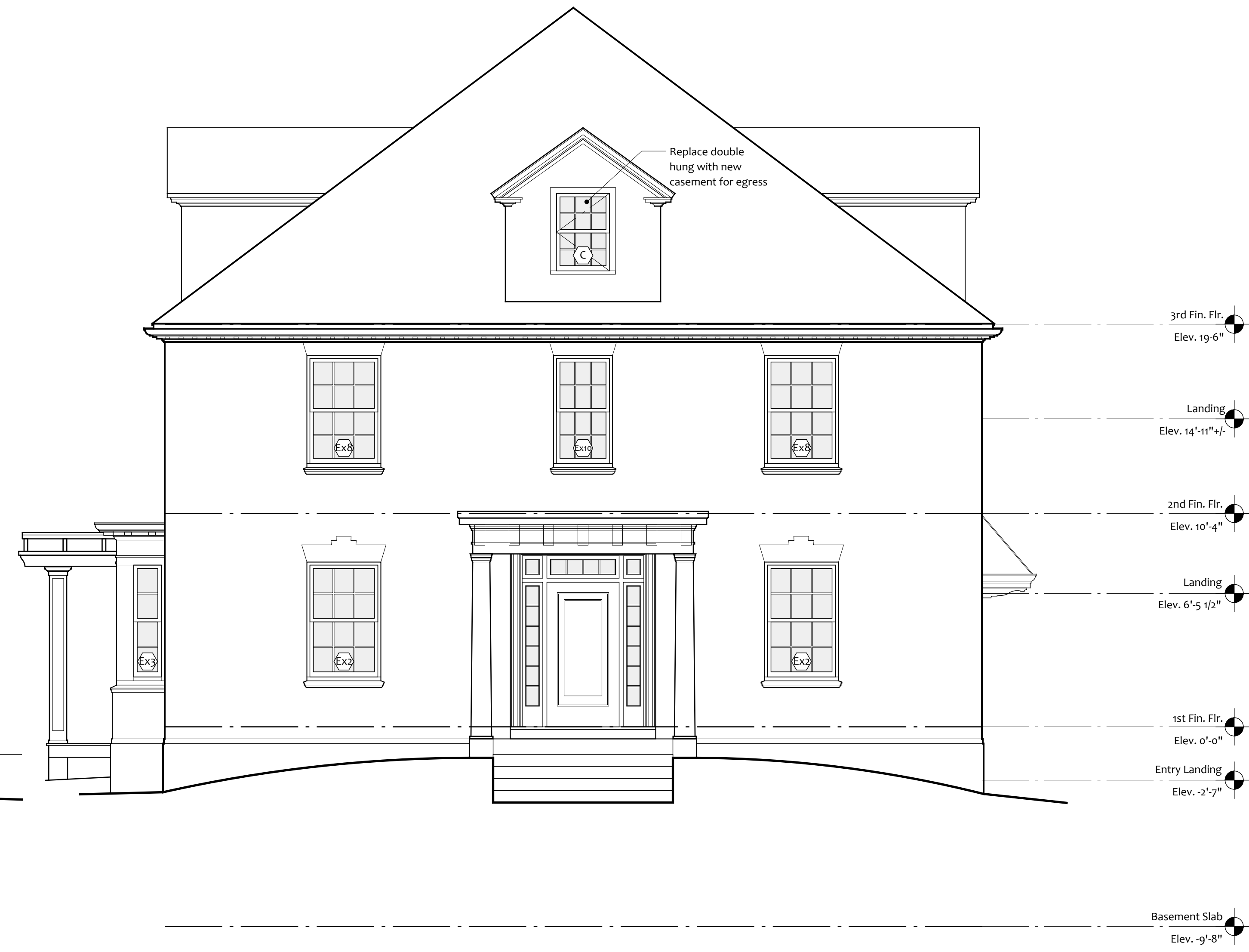
1 East Elevation