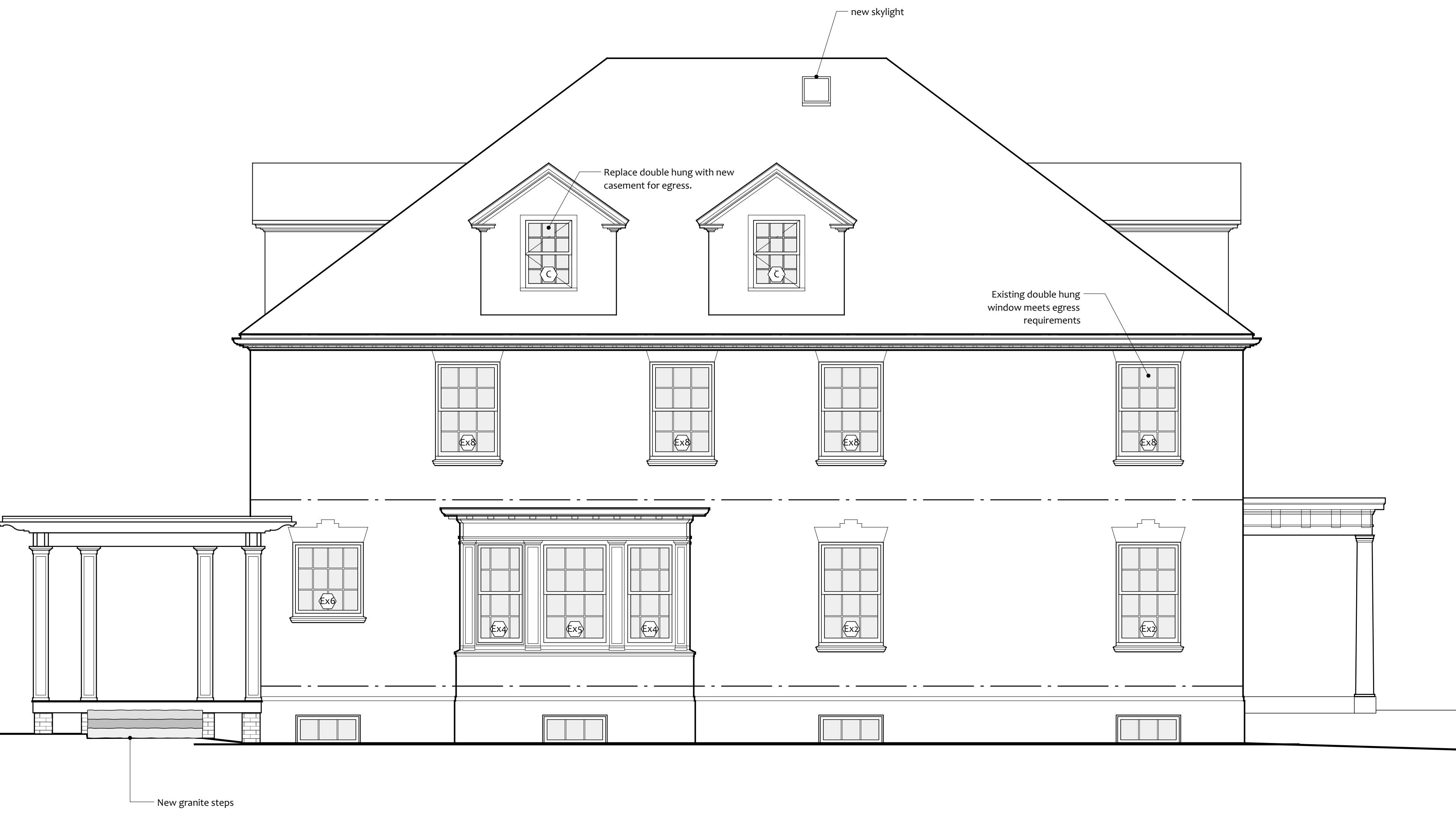
2 South Elevation