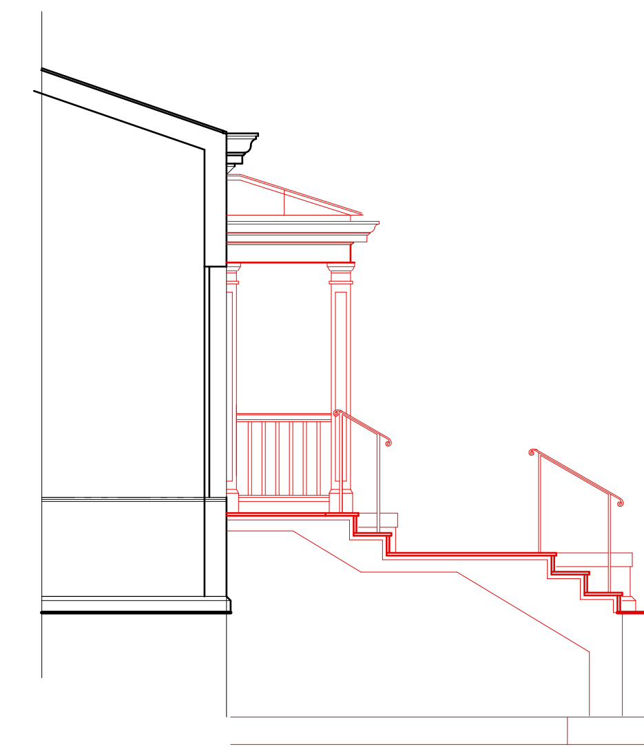
NEW ENTRANCE PORCH Looking east