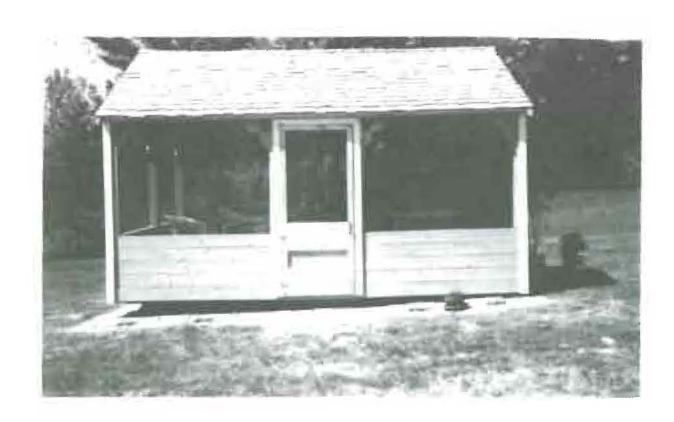
10' x 16' SCREEN HOUSE WITH OPTIONAL ADD ON ROOF SHAKES