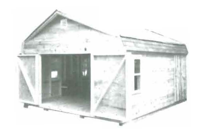
12' x 16' EXTRA HIGH GAMBREL wardow