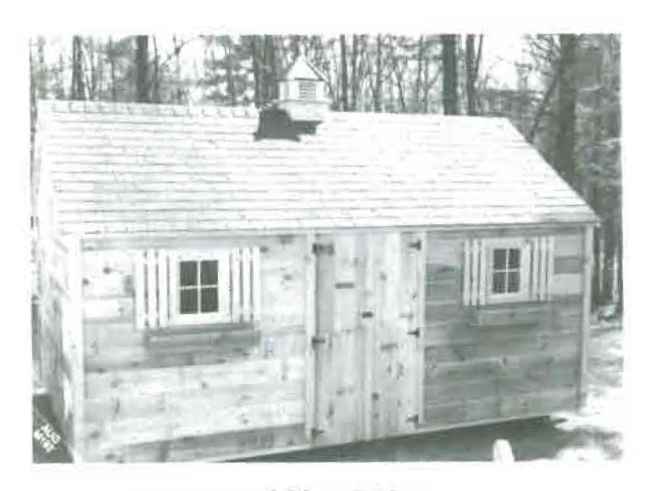
12' x 16' CUPOLA & SHUTTERS