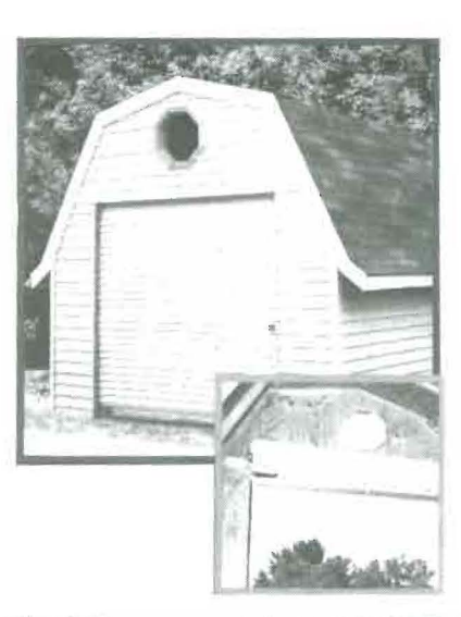
WE ARE THE ONLY MAINE SHED COMPANY WITH OPTIONAL ROLL UP DOORS