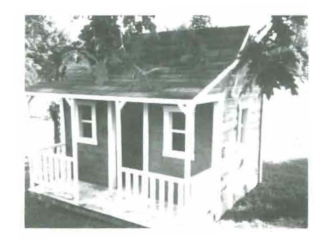
7' x 8' PLAY HOUSE