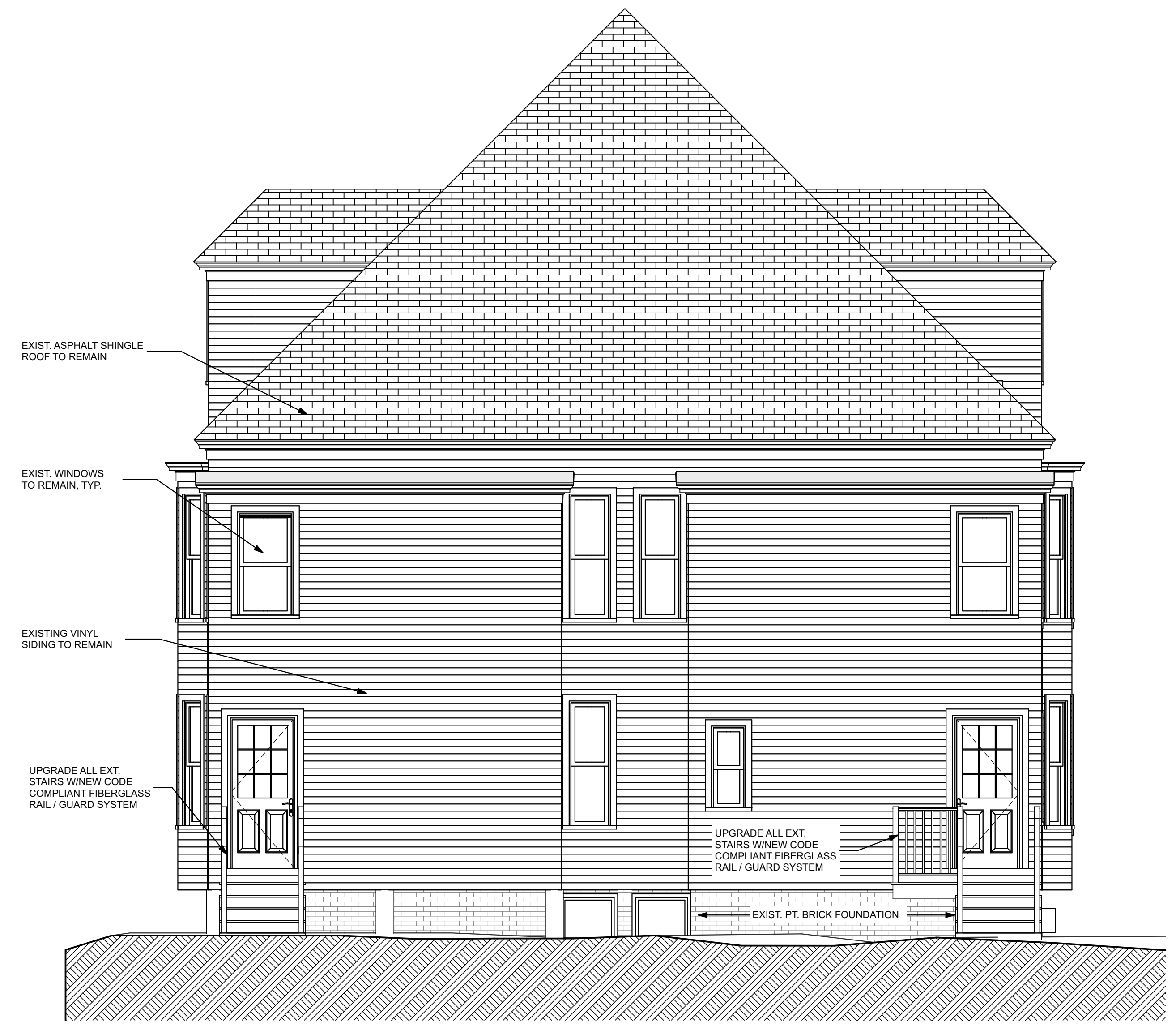
2 BACK ELEVATION A2.2 SCALE: 1/4" = 1'-0"