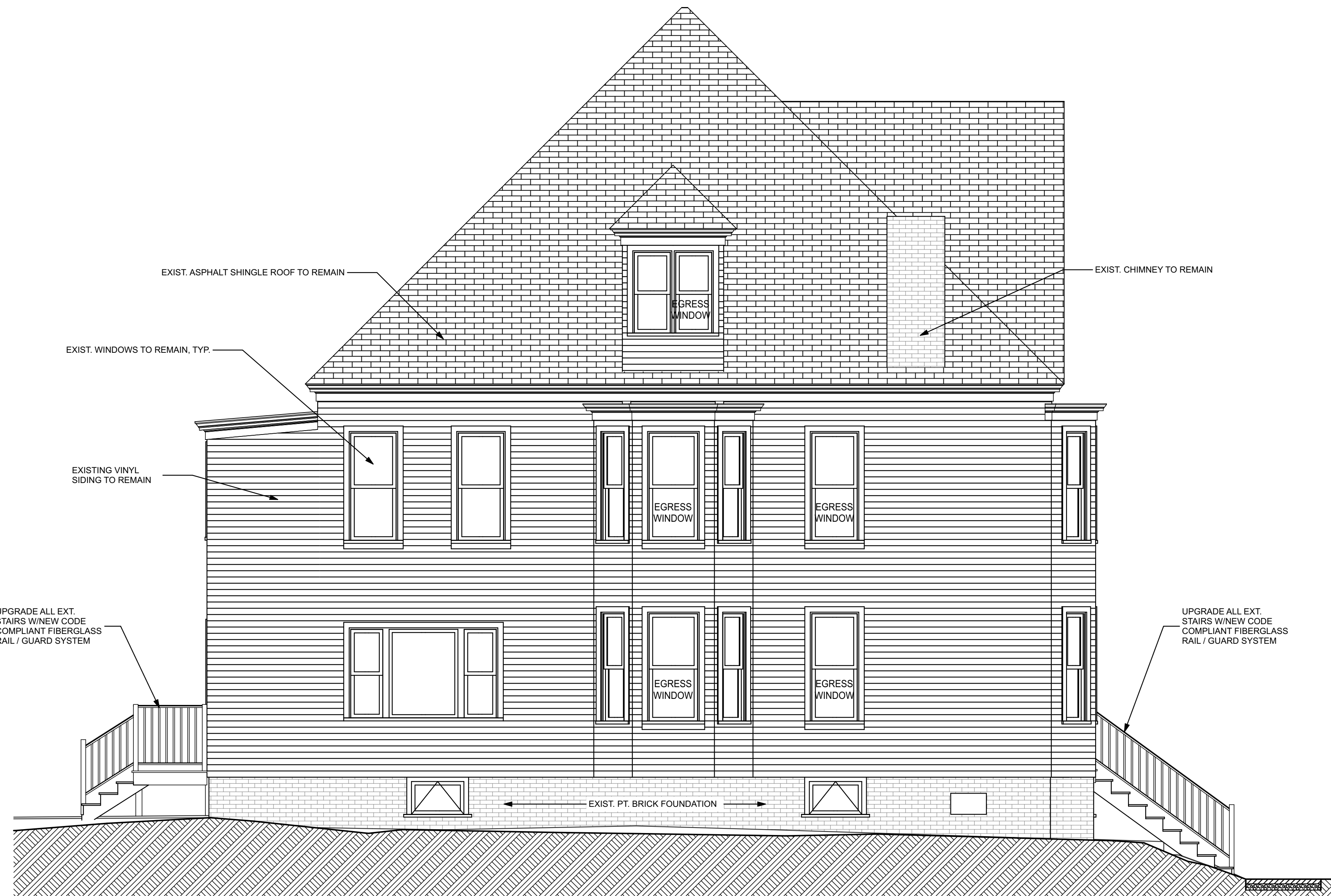
1 SIDE ELEVATION - FALMOUTH STREET A2.2 SCALE: 1/4" = 1'-0"